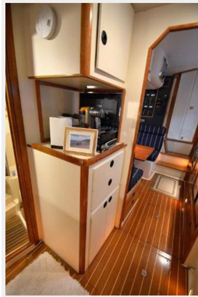
Master Extra Lockers