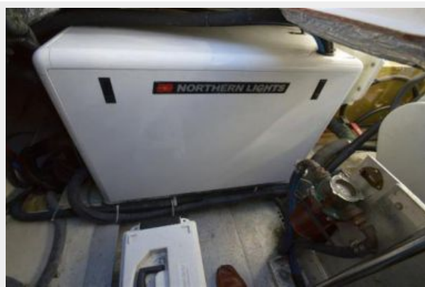
Generator in Sound Shield