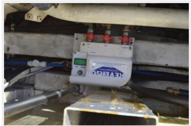
Oil Exchange System