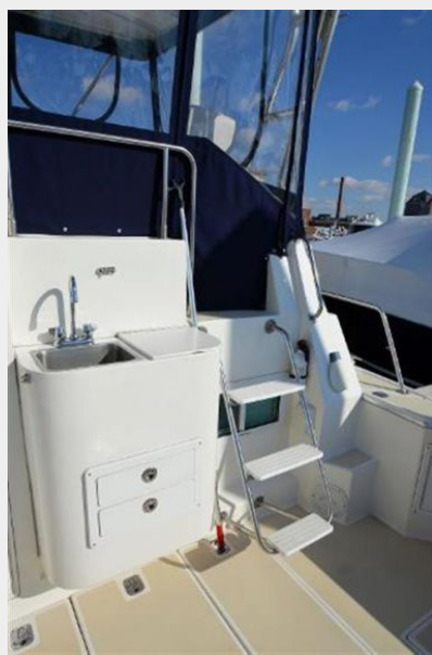
Easy Bridge Steps