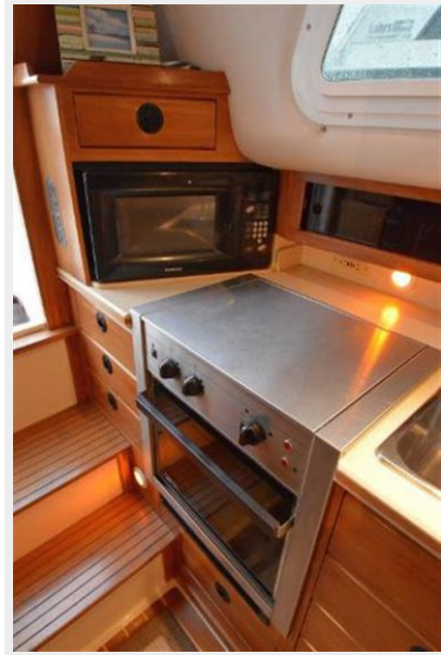
Galley Oven and Micro