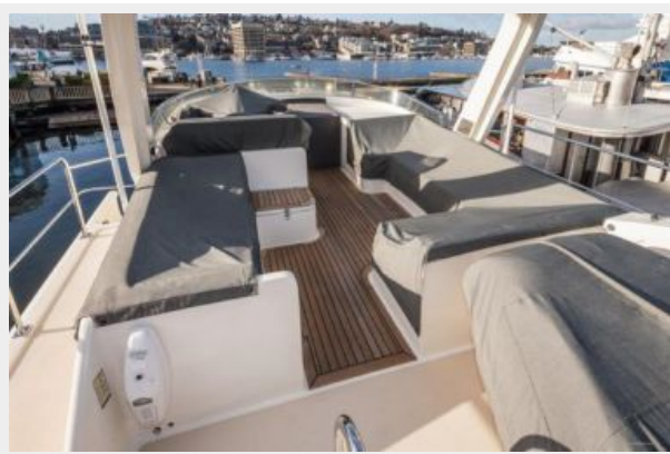
Flybridge Covers - Fwd View