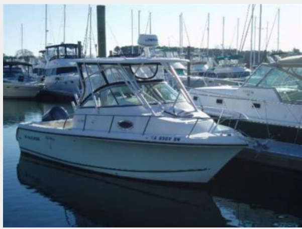
Pole Dancer- Light Sea Foam Green Hull