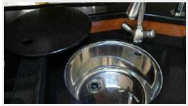
Stainless Steel Sink