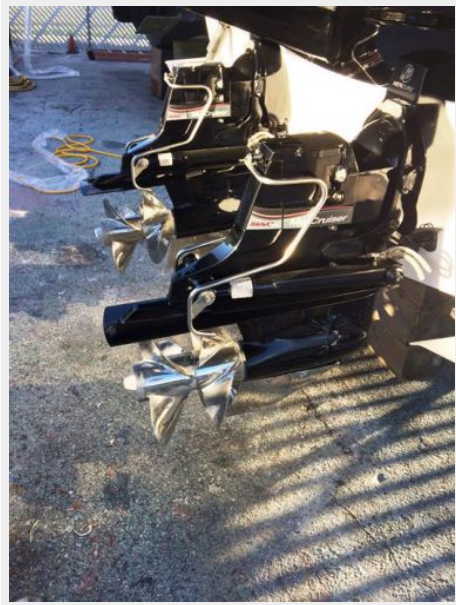
Bravo III Drives