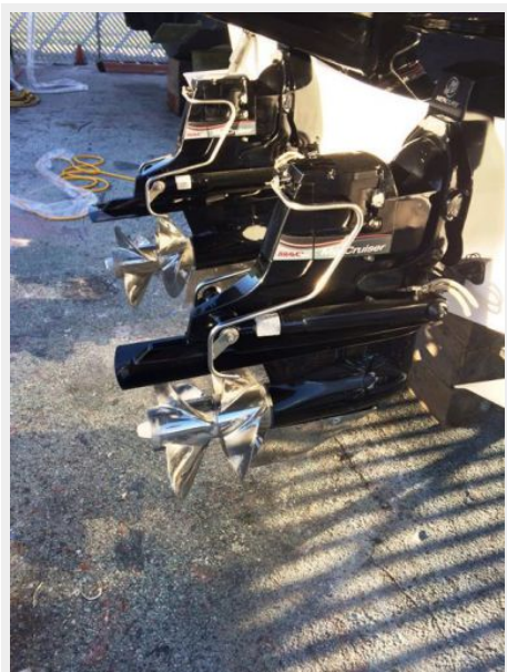
Bravo III Drives