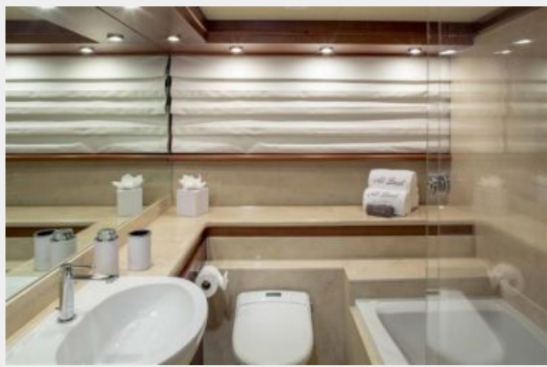
Guest Stateroom Head