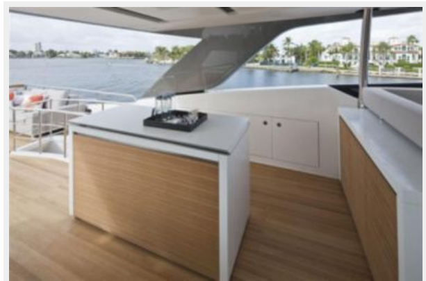
Flybridge Sliding Boffi Bar - Closed