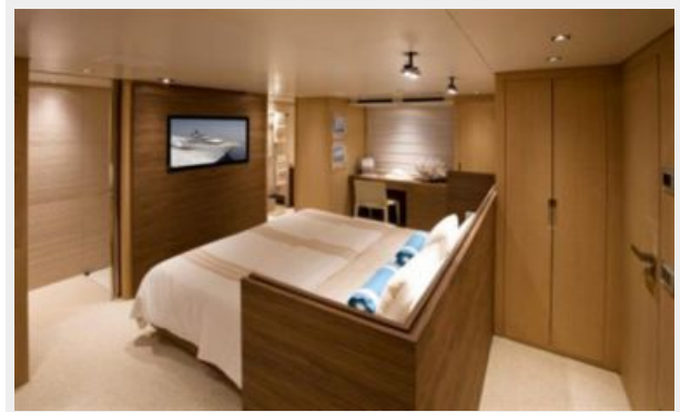
Master Stateroom - Head Open