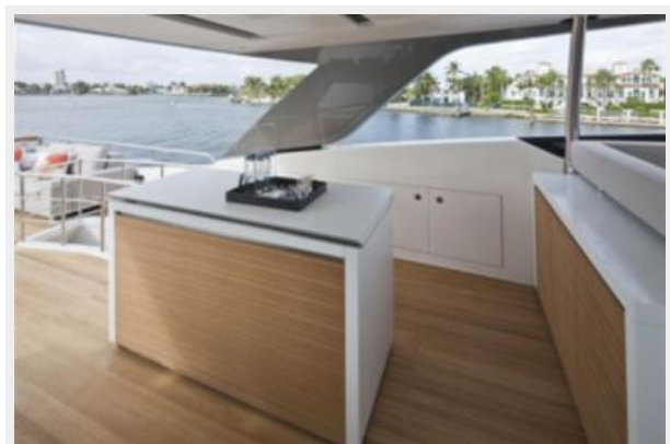
Flybridge Sliding Boffi Bar - Closed