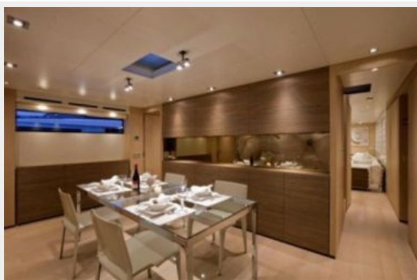
Dining/Multi-purpose Area (1)