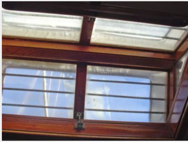
Cherubini Butterfly Overhead Skylight