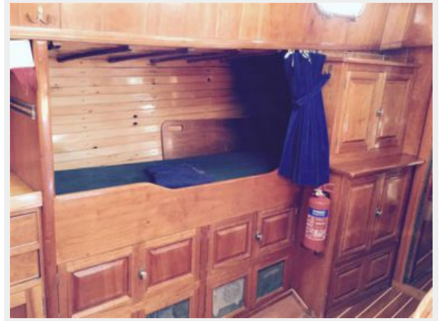
Portside midship Berth