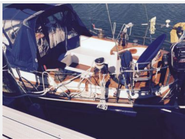
Cockpit with enclosed dodger