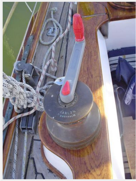
Barlow furling line winch