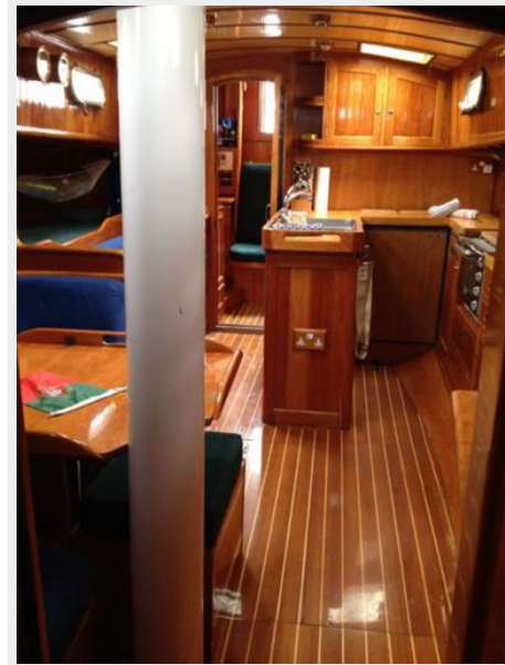
Cabin looking aft to Galley on Port & Dinette, Salon Sofa & Pilot Berth to Starboard