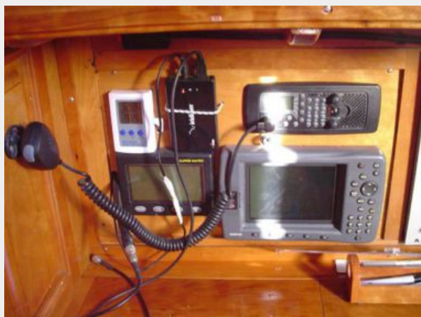
Navigation Station w/VHF & Garmin Plotter