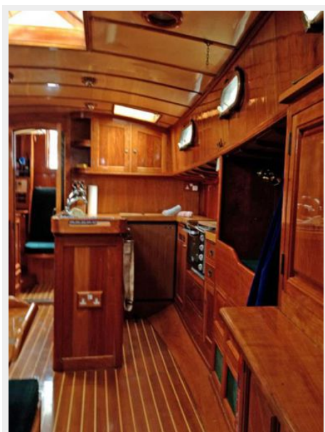
Entrance to Galley, Port