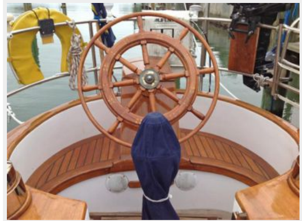
Beautiful Custom Wheel