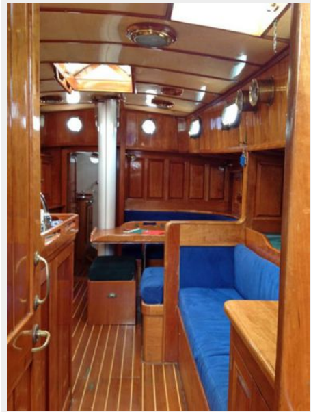
Beautiful Cherrywood Interior & Amazing lighting & ventilation