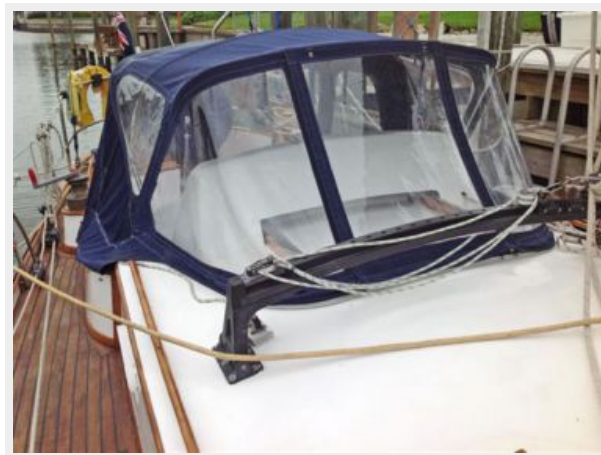
Fully enclosed dodger