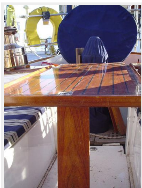
Cockpit sole raises to form cockpit table