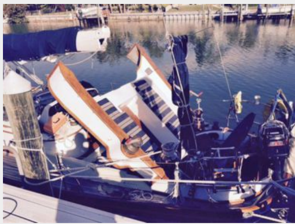
Cockpit Floor hydraulically lifts up to access engine compartment