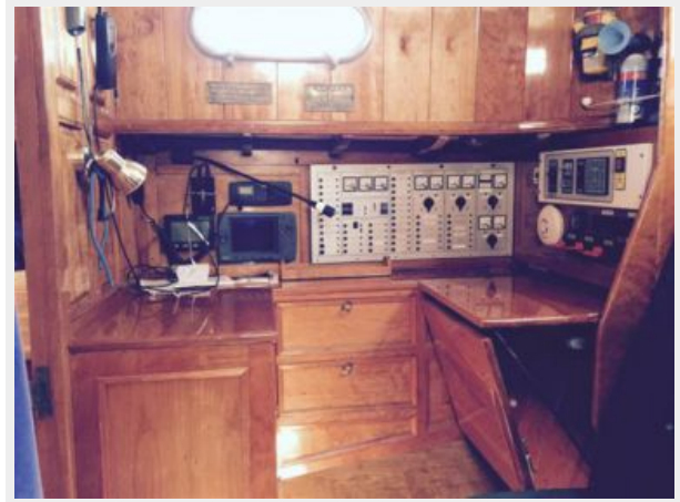
Navigation Station Starboard with Fold-down table