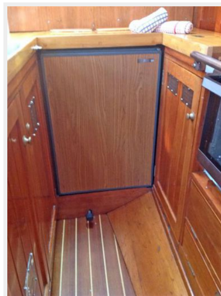
Front Loading Refrigerator