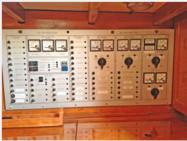
DC/AC Electrical Panel