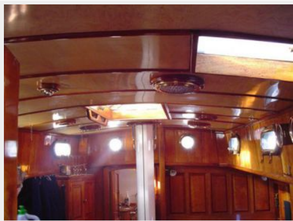
Main Salon looking forward