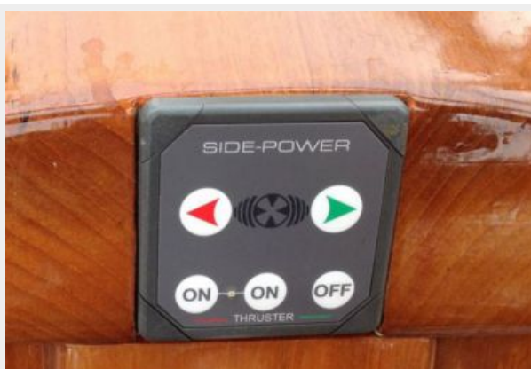
Bow Thruster at helm w/dual props for added power/Remote control at Nav Station