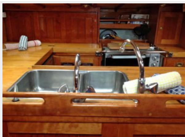
Double Stainless Steel Sink