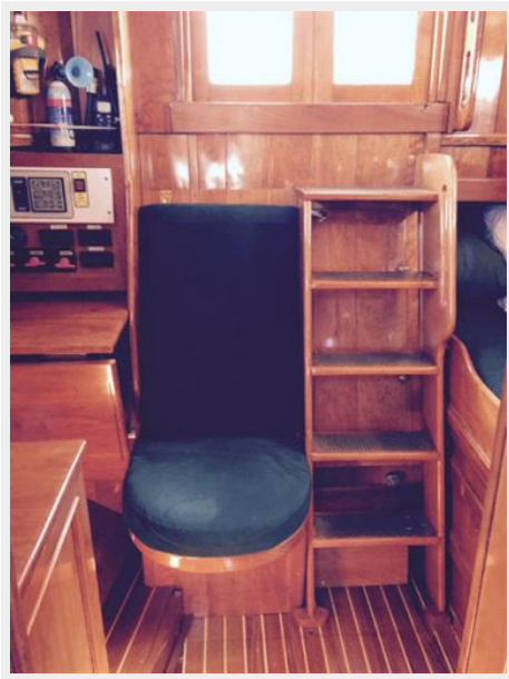
Companionway with Nav Station to Starboard with Cushioned Seat