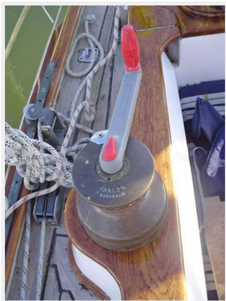
Barlow furling line winch