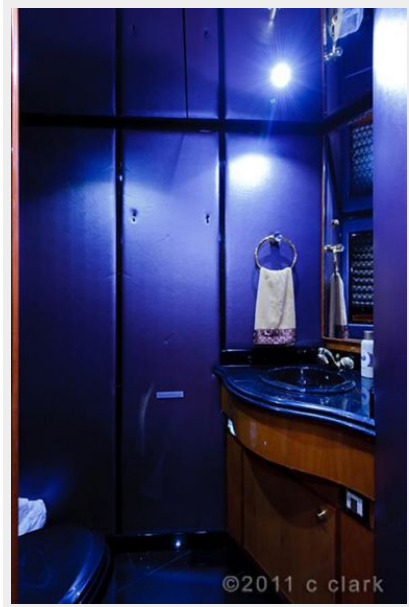
Sky Lounge Head