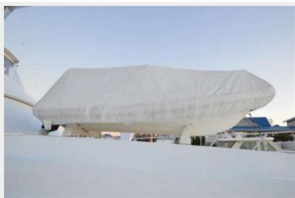
Viking Yachts 55' Convertible Novurania Inflatable