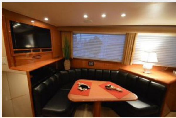
Viking Yachts 55' Convertible Galley Seating