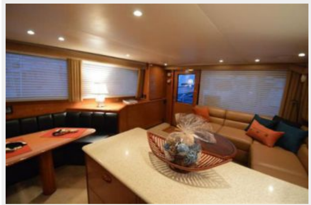
Viking Yachts 55' Convertible Salon Forward