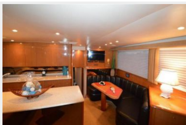
Viking Yachts 55' Convertible Galley Salon Forward