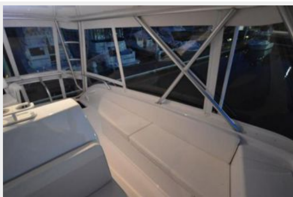
Viking Yachts 55' Convertible Bridge Seating