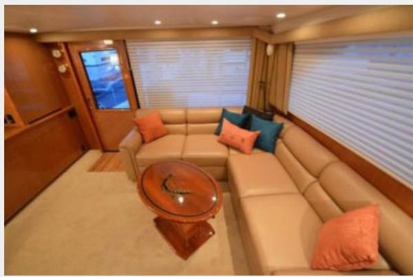
Viking Yachts 55' Convertible Salon Seating