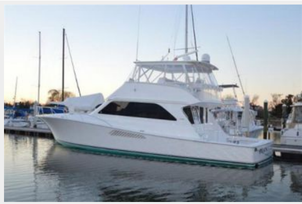
Viking Yachts 55' Convertible Profile