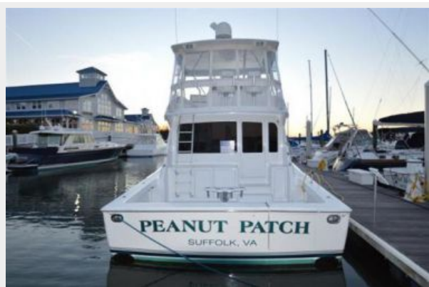
Viking Yachts 55' Convertible Stern