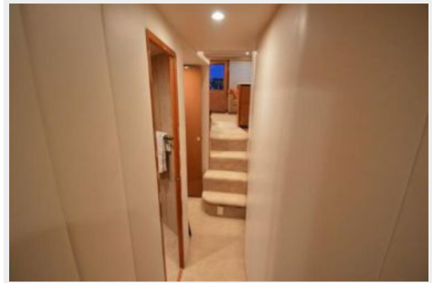
Viking Yachts 55' Hallway to Forward Staterooms