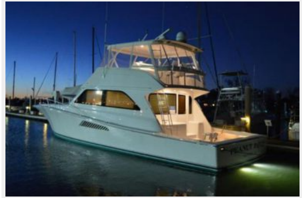
Viking Yachts 55' Convertible Evening Profile