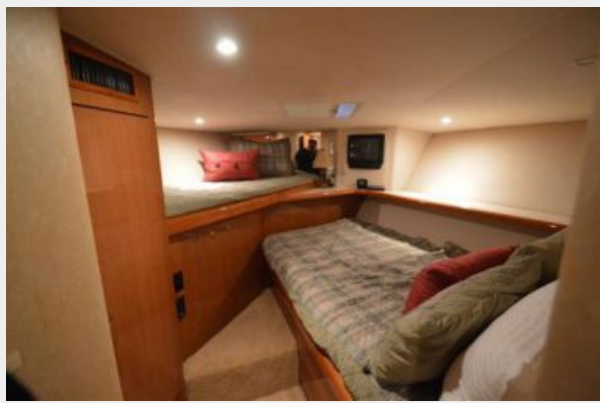
Viking Yachts 55' Convertible VIP Stateroom