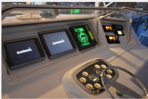
Viking Yachts 55' Convertible Helm Electronics