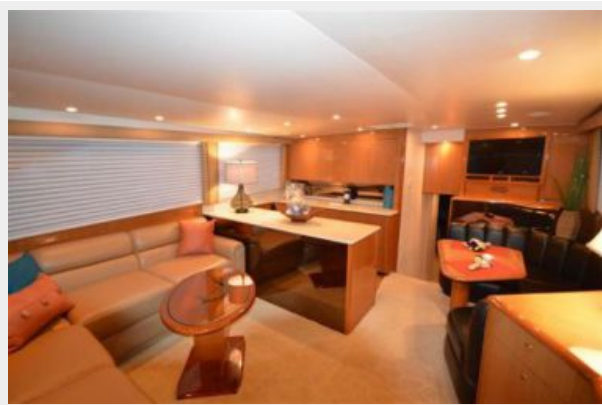
Viking Yachts 55' Convertible Salon