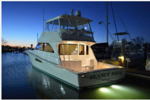
Viking Yachts 55' Convertible Underwater Lights