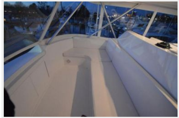
Viking Yachts 55' Convertible Bridge Seating