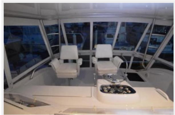
Viking Yachts 55' Convertible Helm Seating