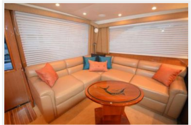
Viking Yachts 55' Convertible Salon Seating