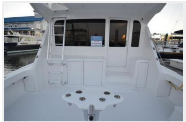
Viking Yachts 55' Convertible Cockpit