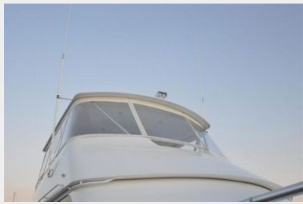
Viking Yachts 55' Convertible New Bridge Enclosure