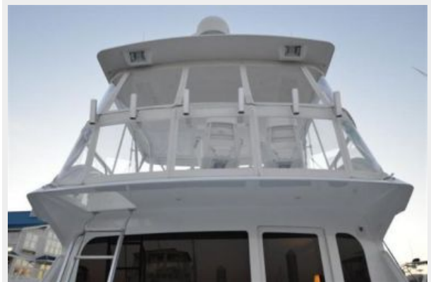
Viking Yachts 55' Convertible New Bridge Enclosure