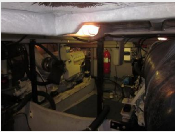
Engine Room Port