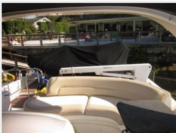
Aft seating and Dingy&Davit