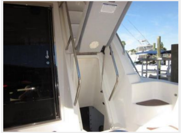
Engine room Access