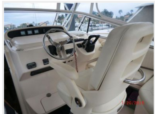
Helm and Helm Seat