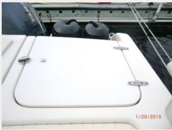
Fender Holders and Storage Box