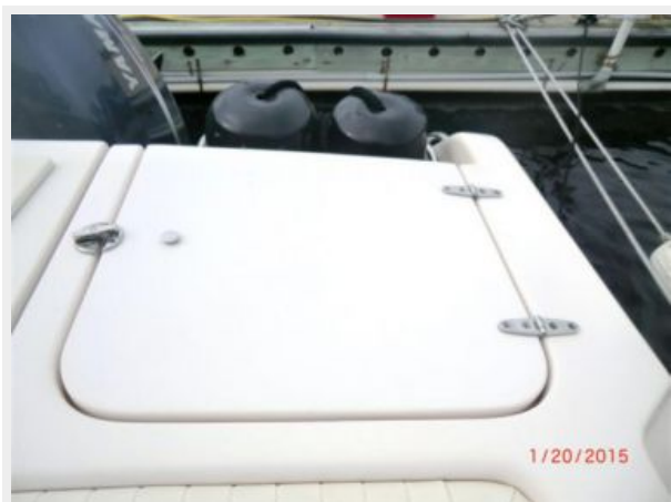
Fender Holders and Storage Box