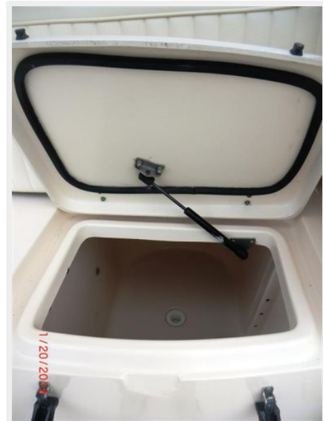
Cockpit Live Well