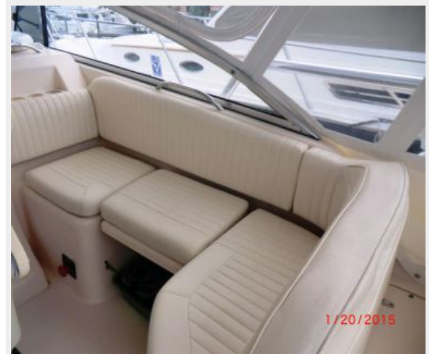
Starboard Guest Seating