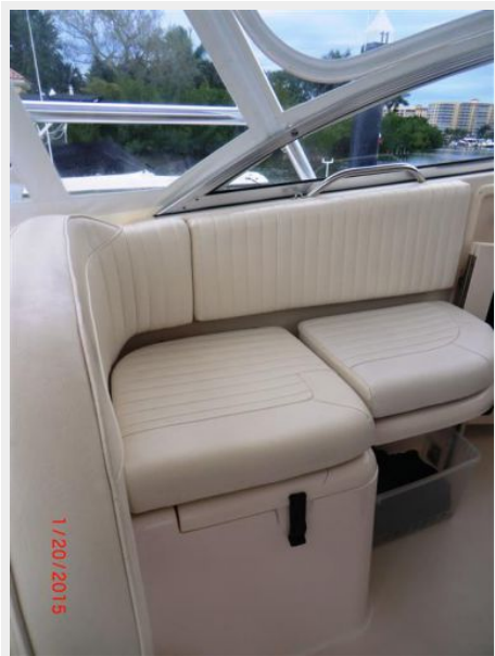
Port Companion Seating