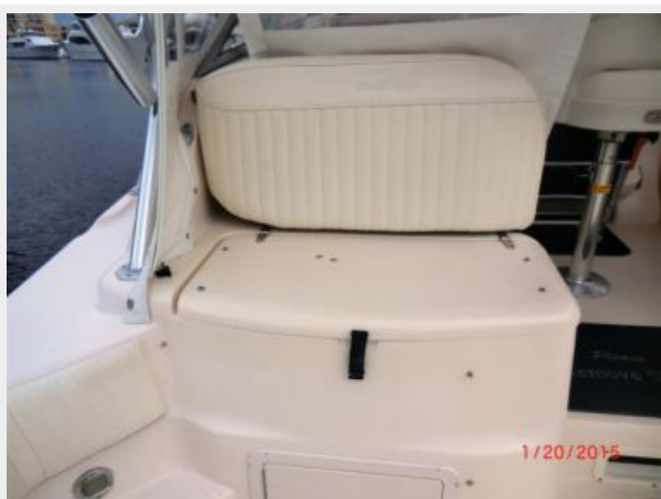
Cockpit Port Aft Facing Set