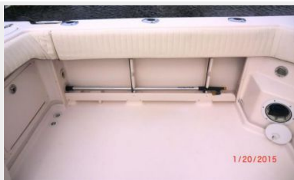
Cockpit Port Side