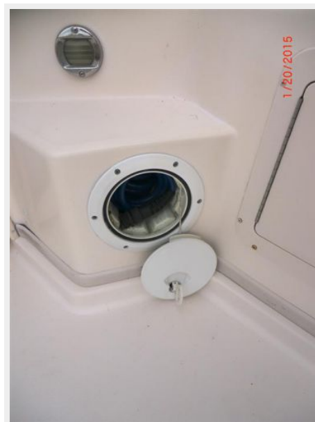
Cockpit Water Hose