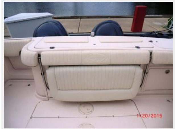
Cockpit Foldaway Seat