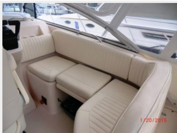
Starboard Companion Seating