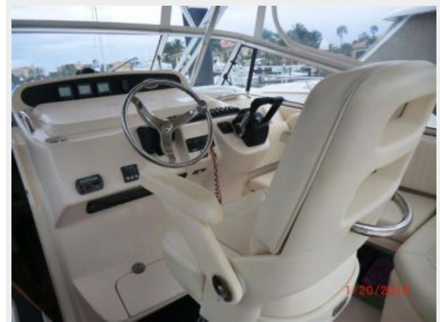
Helm and Helm Seat