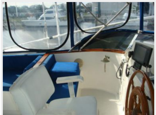
44' DeFever Flybridge Port