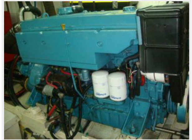
44' DeFever Port Main Engine