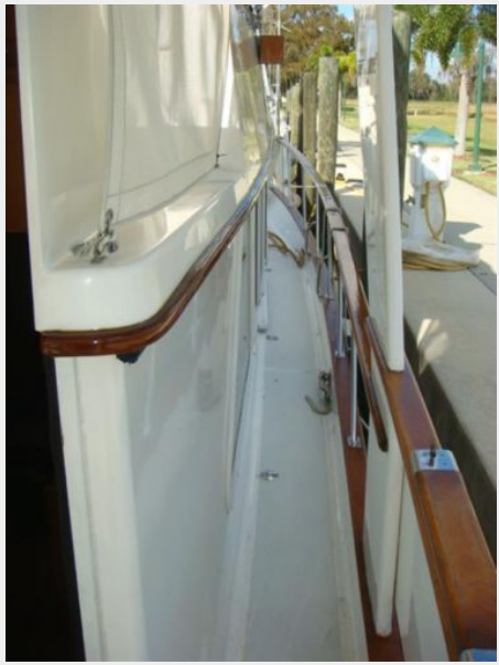
44' DeFever Starboard Side Deck photo2