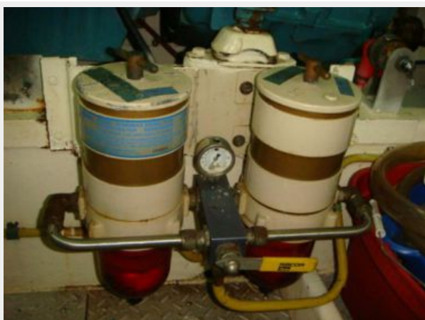
44' DeFever Starboard Racor Fuel Filters