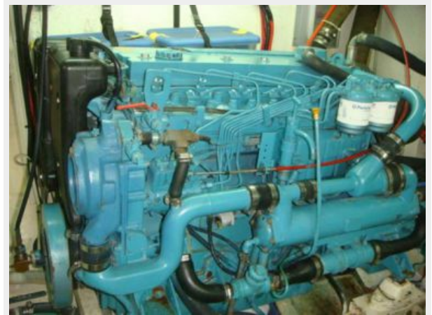
44' DeFever Starboard Main Engine