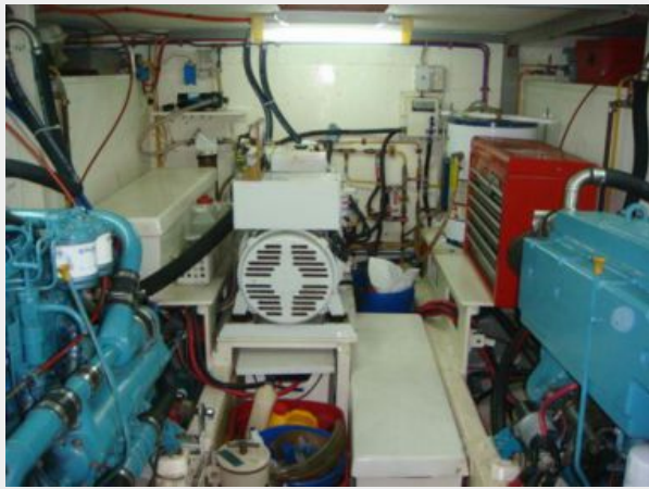
44' DeFever Engine Room Aft