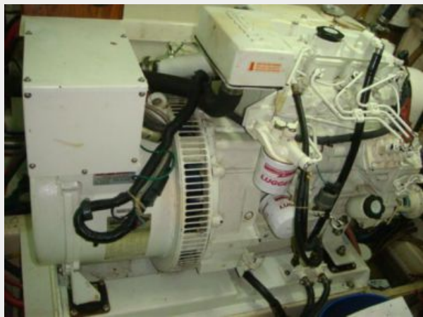
44' DeFever Generator