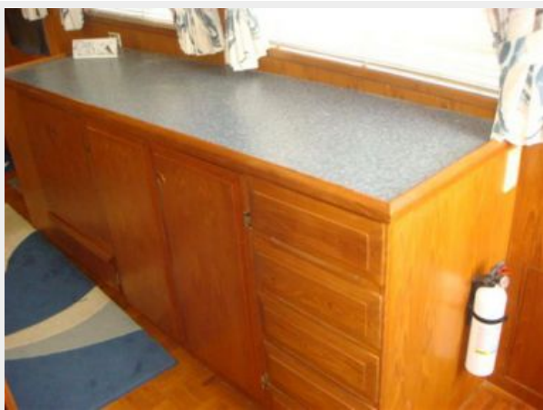
44' DeFever Salon Cabinetry photo1