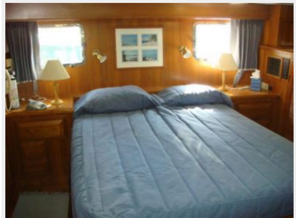
44' DeFever Master Stateroom