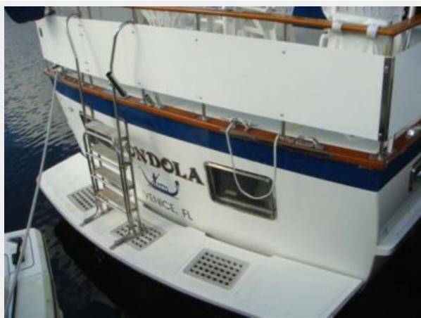
44' DeFever Swim Platform