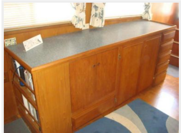
44' DeFever Salon Cabinetry photo2