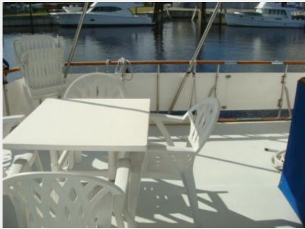
44' DeFever Sundeck Port