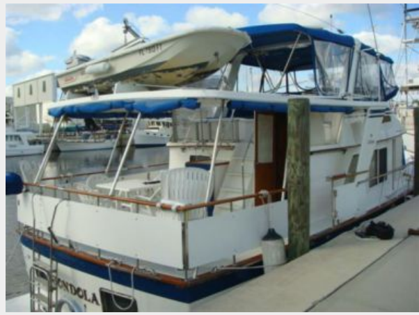
44' DeFever Starboard Aft Profile