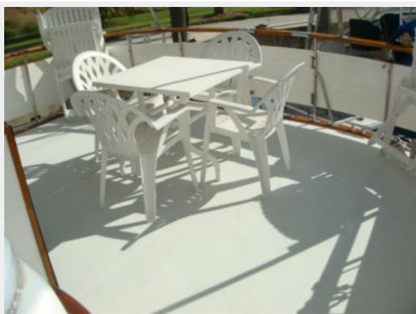
44' DeFever Sundeck