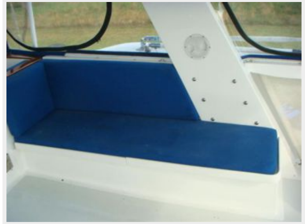
44' DeFever Flybridge Starboard Seating