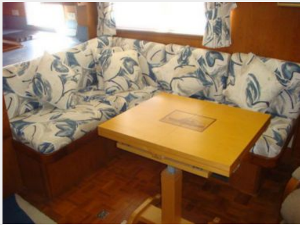
44' DeFever Salon Seating