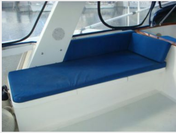
44' DeFever Flybridge Port Seating