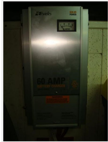
44' DeFever Battery Charger 1