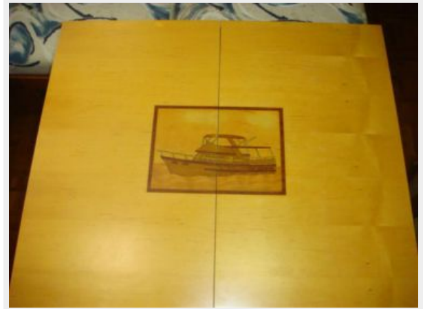
44' DeFever Table Top