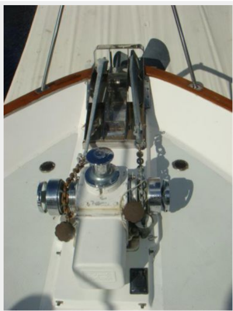
44' DeFever Anchor Windlass