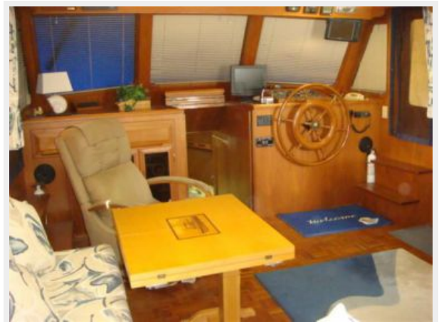
44' DeFever Salon Forward