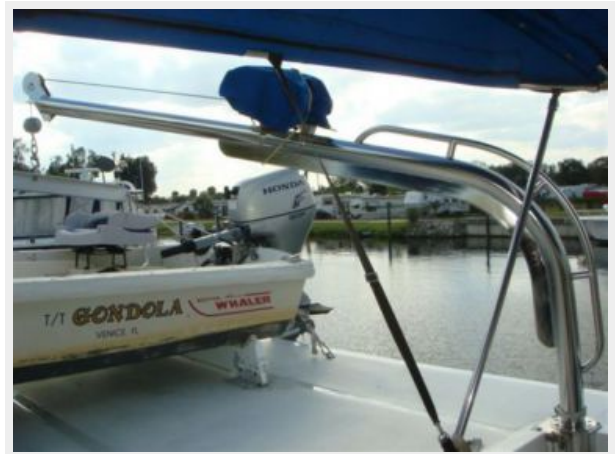
44' DeFever Tender Davit