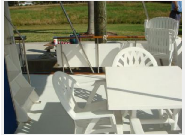
44' DeFever Sundeck Starboard