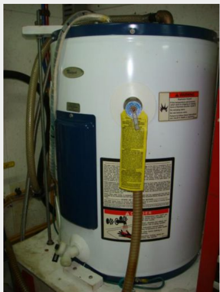
44' DeFever Water Heater