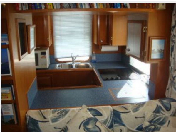
44' DeFever Galley photo1