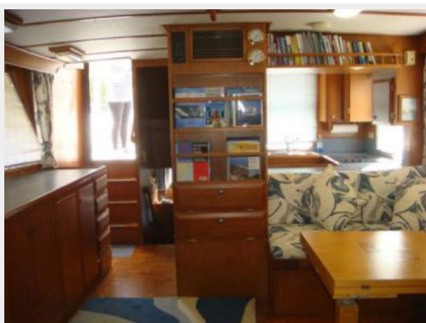
44' DeFever Salon Aft