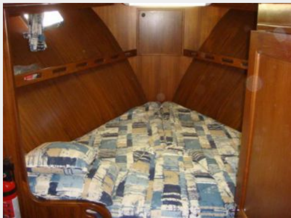
44' DeFever Guest Stateroom photo2