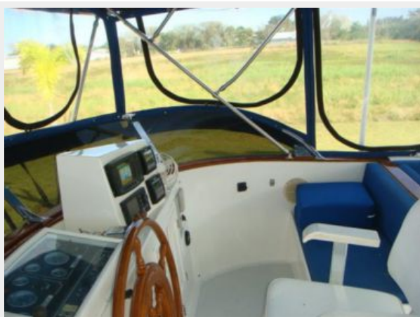
44' DeFever Flybridge Starboard