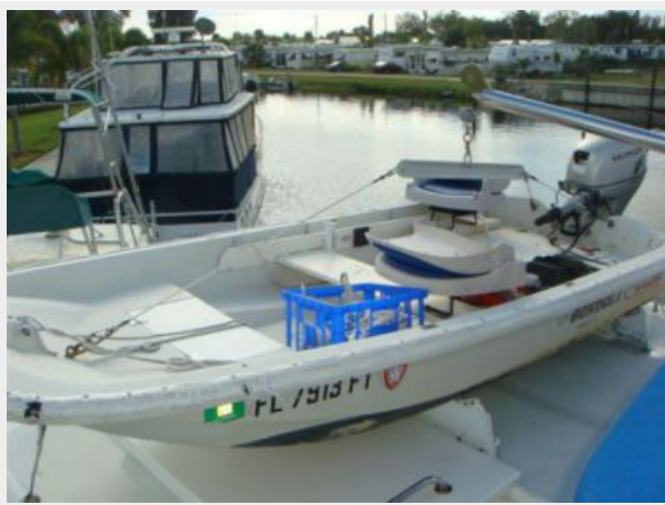
44' DeFever Tender