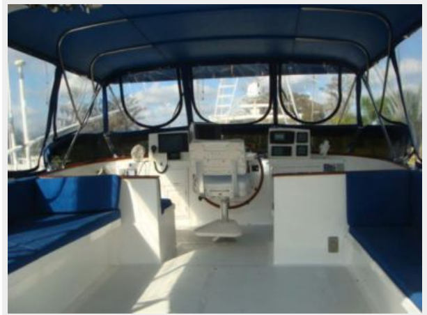
44' DeFever Flybridge Forward