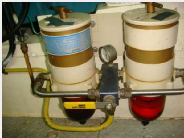
44' DeFever Port Racor Fuel Filters