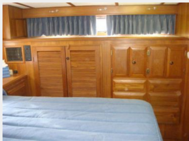
44' DeFever Master Stateroom Port