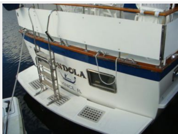
44' DeFever Swim Platform