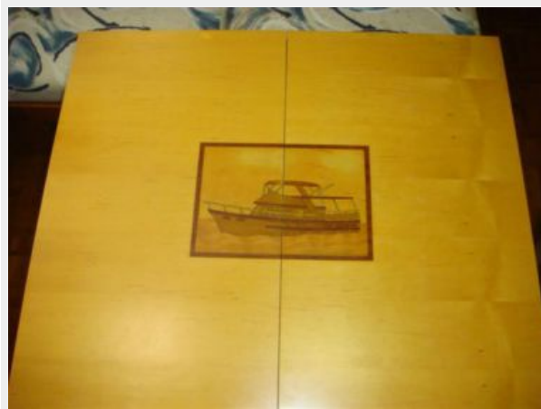
44' DeFever Table Top