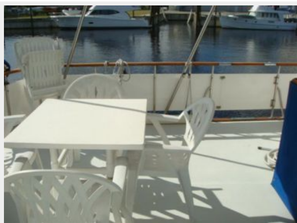
44' DeFever Sundeck Port