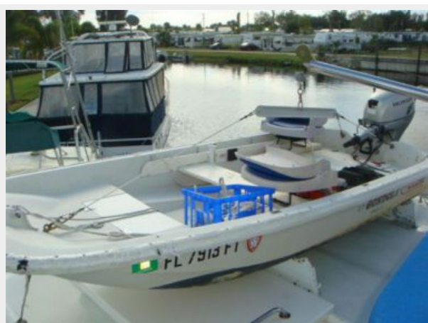
44' DeFever Tender