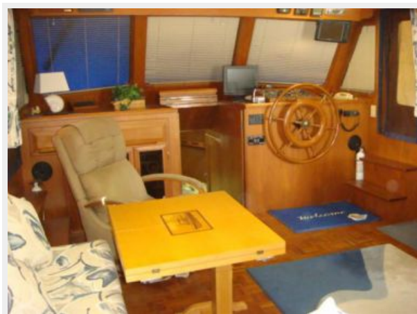
44' DeFever Salon Forward