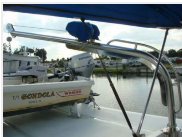
44' DeFever Tender Davit