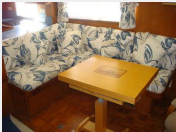
44' DeFever Salon Seating