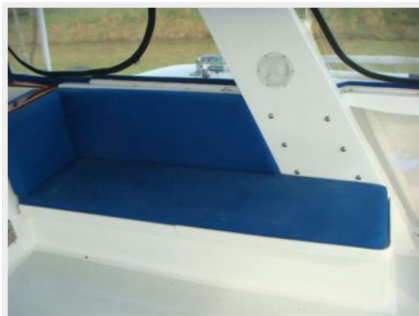
44' DeFever Flybridge Starboard Seating