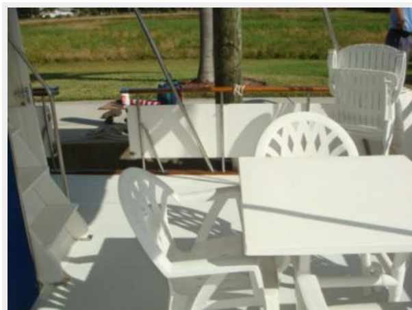
44' DeFever Sundeck Starboard