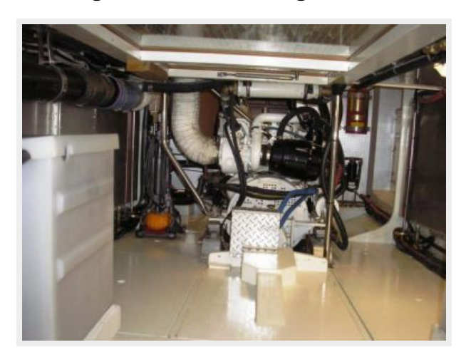
Engine Room Looking Forward