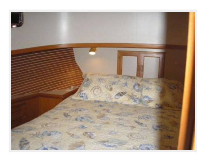
Master Stateroom - Portside