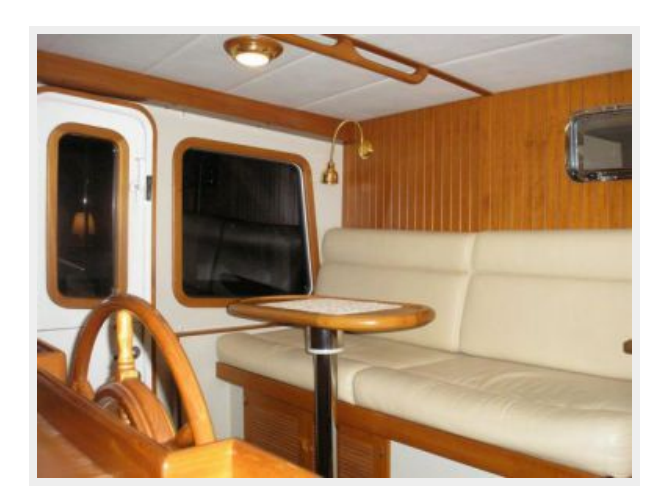
Pilothouse - Starboard