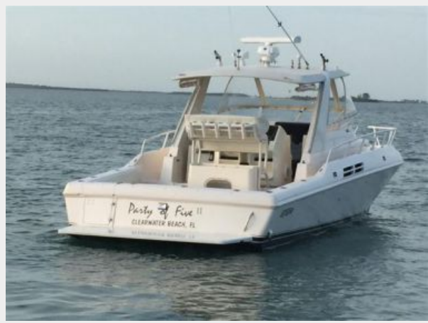
Transom View Starboard