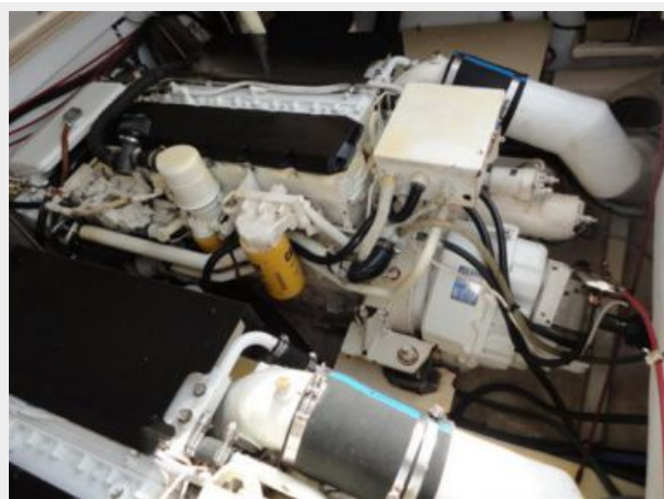
Inboard Side of Starboard Engine