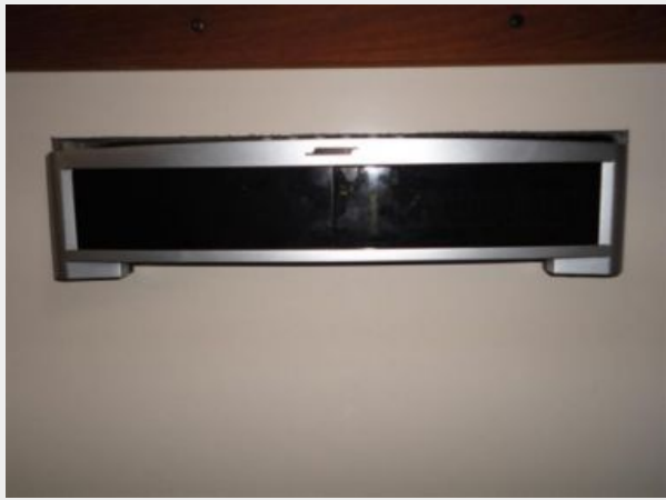
Bose Surround Sound System