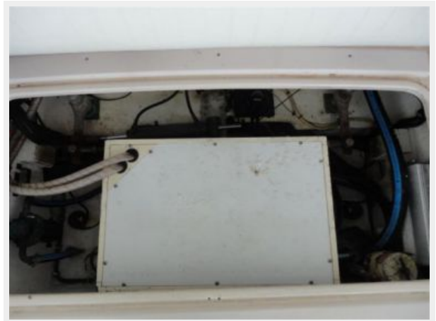
Generator Sound Shield