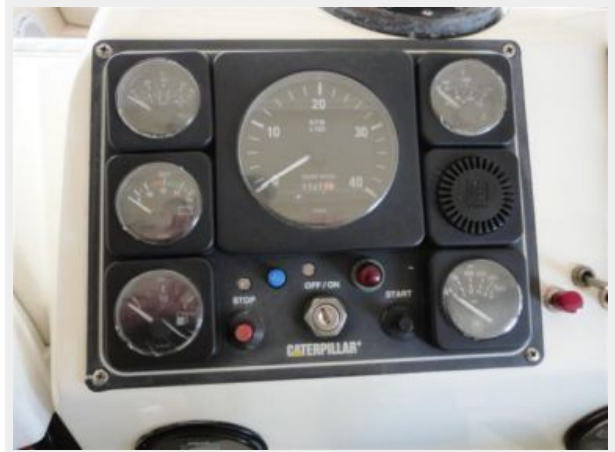
Port Engine Gauges