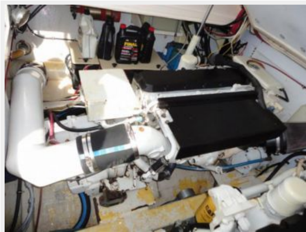
Inboard Side of Port Engine