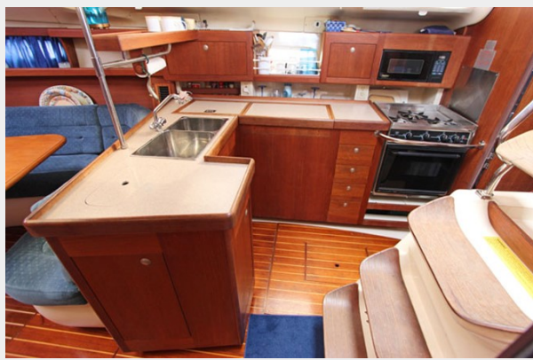
Full Galley W/Sink, Fridge, Freezer, Microwave, & Oven/Stove