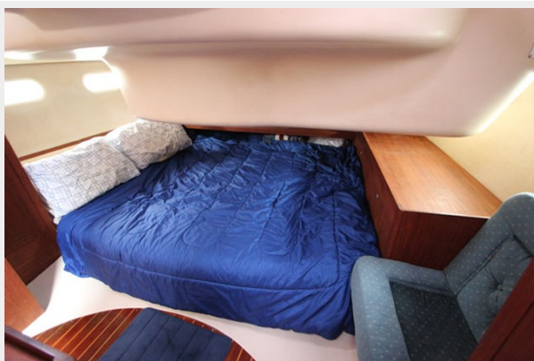
Aft Stateroom w/Large King Berth & Settee