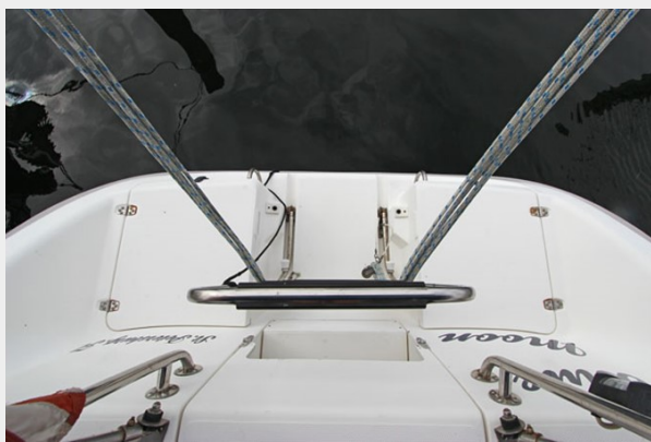
Transom Swim Platform w/Fold-down Stainless Anchor