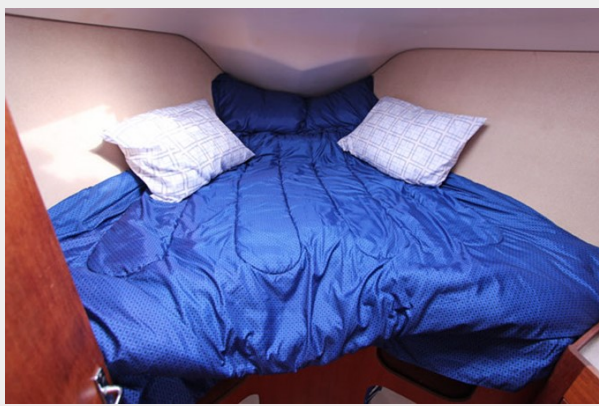
Forward Queen Berth