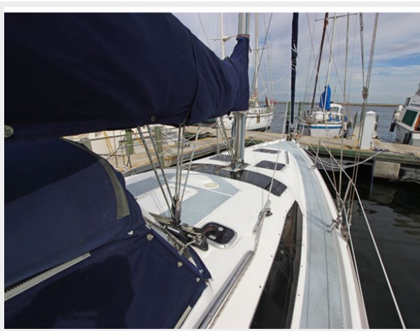
Deck Starbord Side