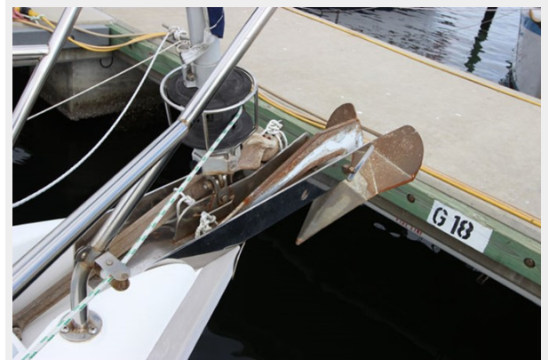
1-35lb Delta Anchor & 1-35lb CQR Plow Anchor