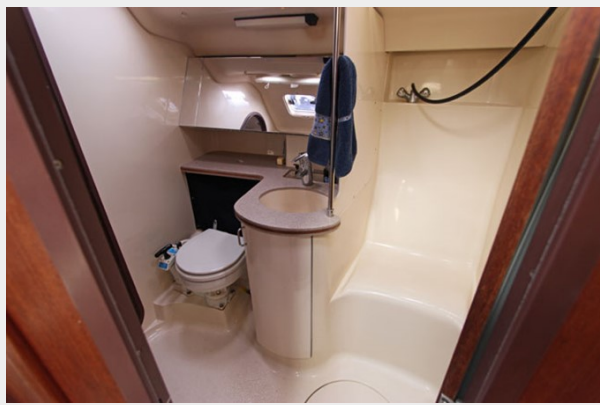
Head View from Salon Entry