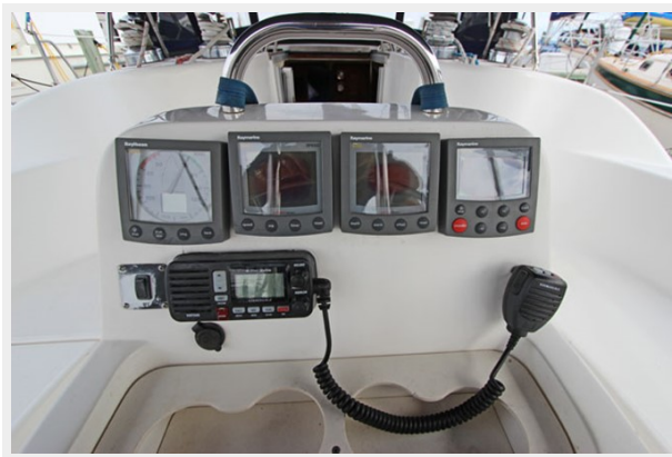
Cockpit Navigation Panel W/West Marine 580 VHF Radio, Raymarine ST60 Wind/Speed/Depth, & Raymarine ST 5000+ Autopilot