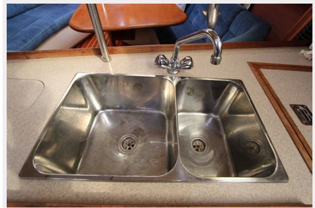
Stainless 70/30 Sink