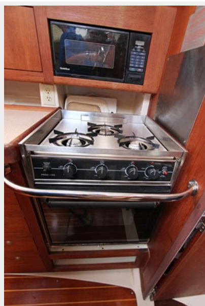
Goldstar Microwave & Princess Oven W/Propane 3-Burner Stove