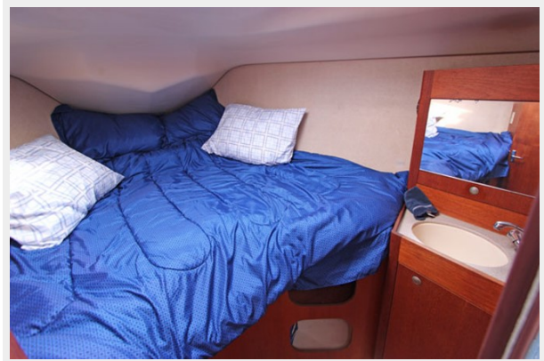
Forward Berth W/Vanity & Sink