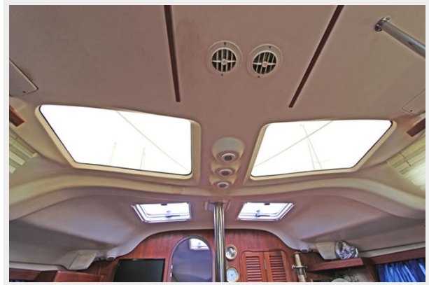
Salon Skylights To Provide Plenty Of Natural Lighting