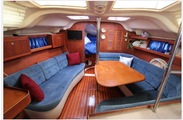
Salon Seating & Dining Area w/Teak Table, Starboard Dining Area Converts to Queen Berth