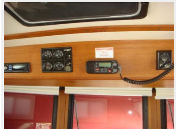
32' Nordic Tug pilothouse electronics2