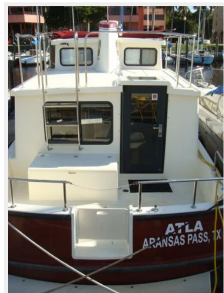
32' Nordic Tug aft profile photo1