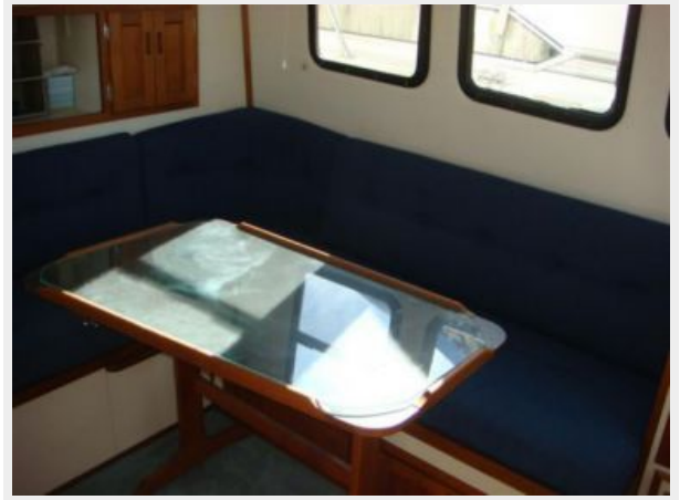
32' Nordic Tug salon starboard seating