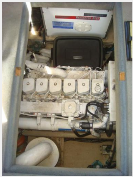
32' Nordic Tug engine room