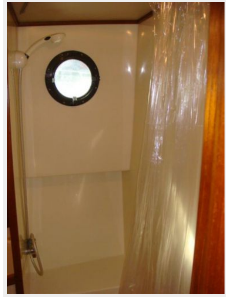
32' Nordic Tug shower