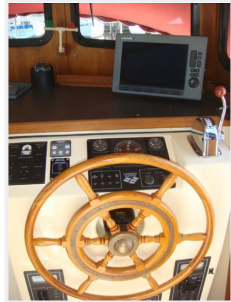
32' Nordic Tug pilothouse helm