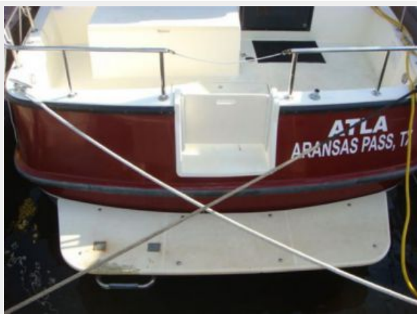
32' Nordic Tug swimplatform