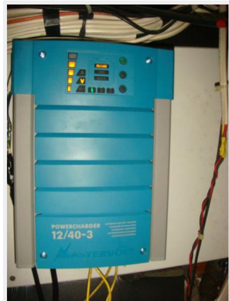
32' Nordic Tug battery charger