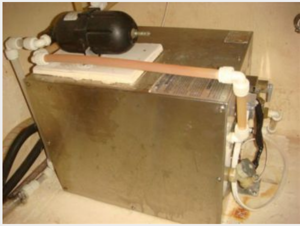
32' Nordic Tug water heater