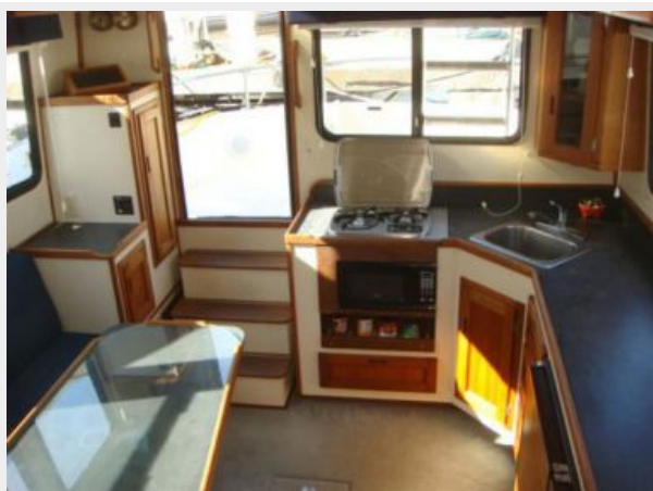
32' Nordic Tug salon aft