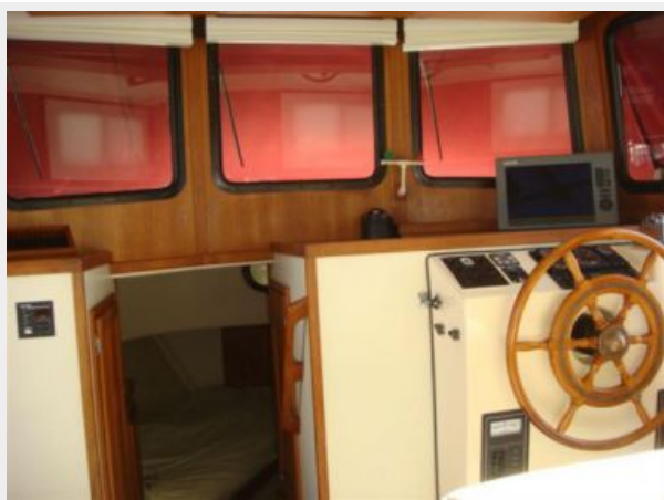
32' Nordic Tug pilothouse forward