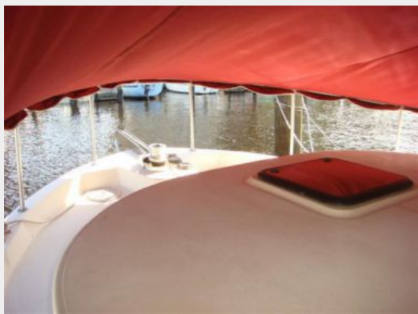
32' Nordic Tug foredeck