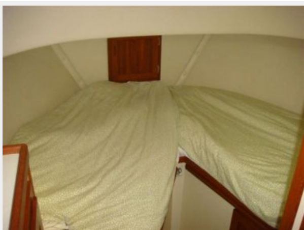
32' Nordic Tug master stateroom