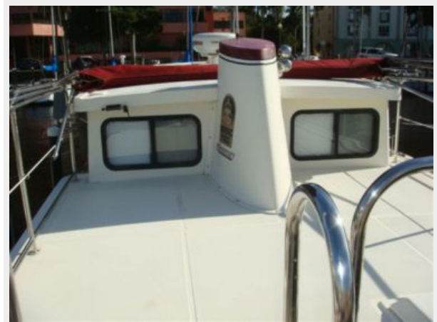
32' Nordic Tug flybridge