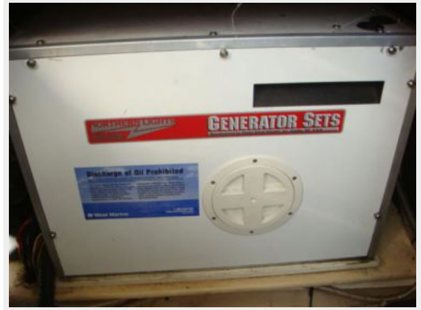
32' Nordic Tug generator sound box