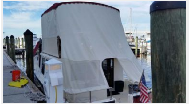
32' Nordic Tug cockpit-flybridge enclosure