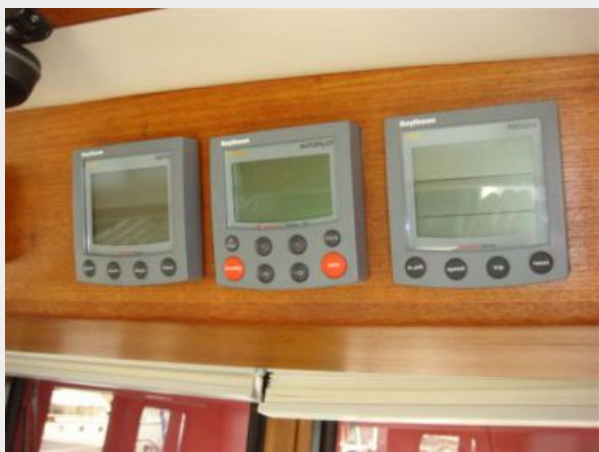
32' Nordic Tug pilothouse electronics1