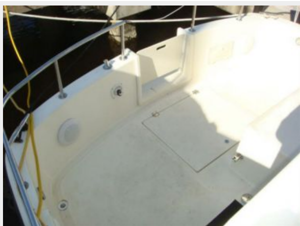
32' Nordic Tug cockpit