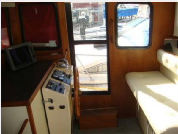
32' Nordic Tug pilothouse starboard