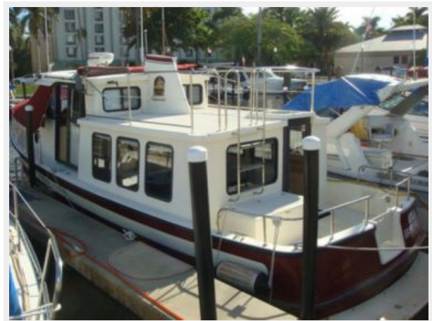
32' Nordic Tug aft profile photo1