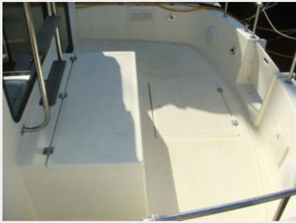
32' Nordic Tug cockpit starboard