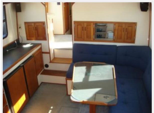
32' Nordic Tug salon forward