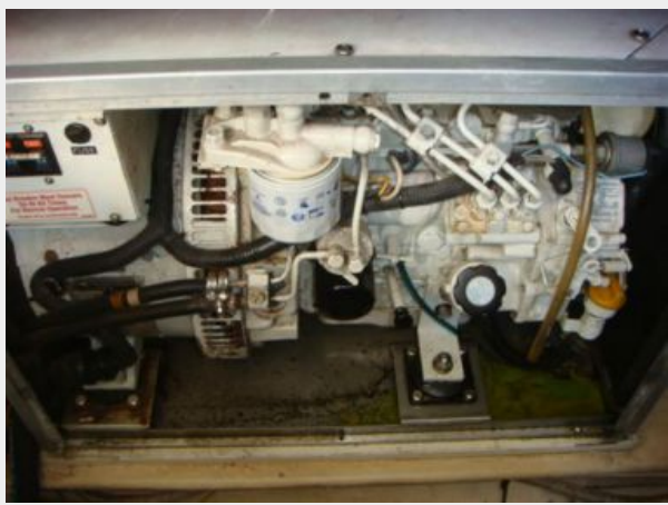
32' Nordic Tug generator