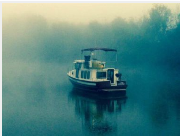
32' Nordic Tug port aft profile photo1