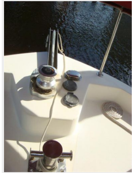
32' Nordic Tug anchor windlass