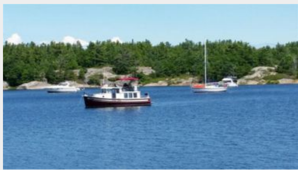
32' Nordic Tug port profile photo2