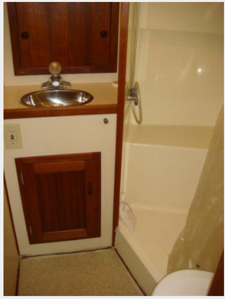
32' Nordic Tug head