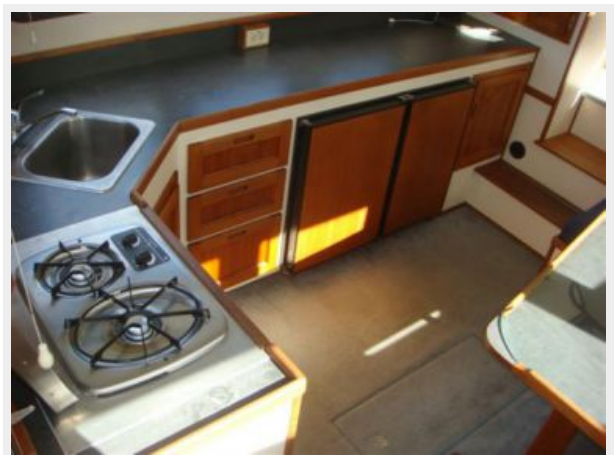
32' Nordic Tug gally photo2