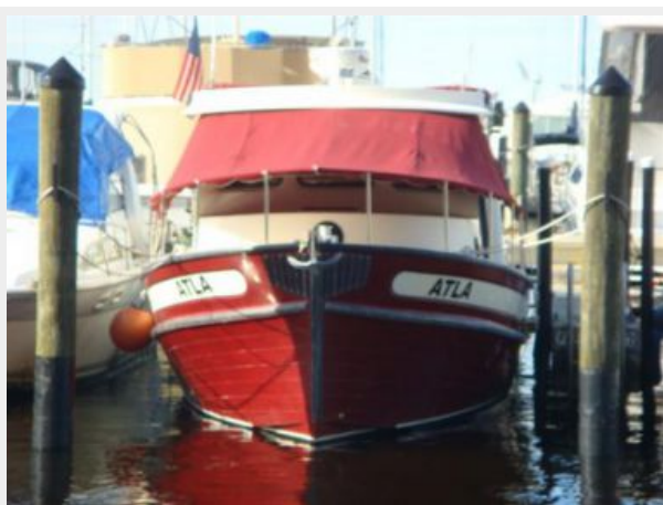
32' Nordic Tug forward profile