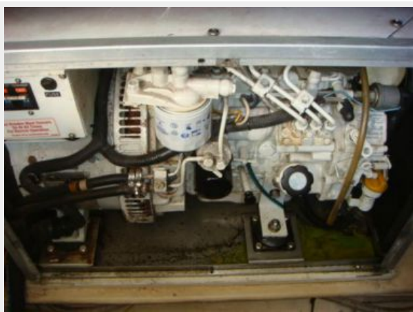
32' Nordic Tug generator