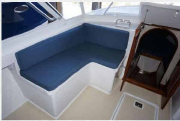
PORT FORWARD SEATING