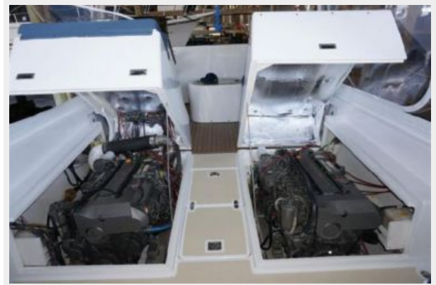
EASY ACCESS TO ENGINES