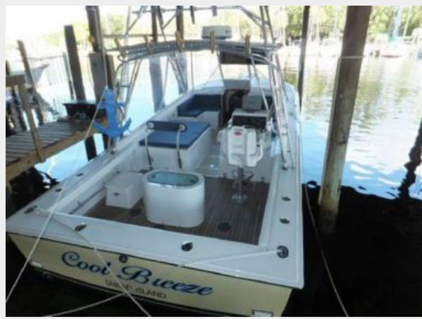
VIEW FROM STERN