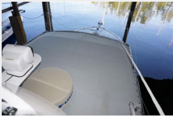
VIEW FORWARD FROM THE BRIDGE