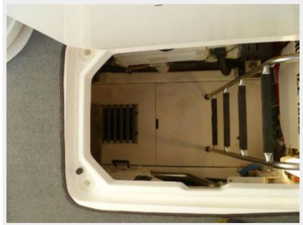
Engine room access