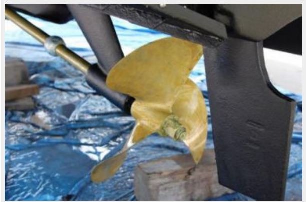
Fresh Bottom paint and prop speed