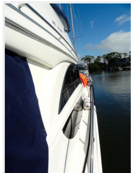
Starboard Side Rail