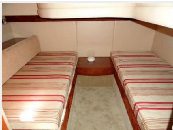
2nd Stateroom 2