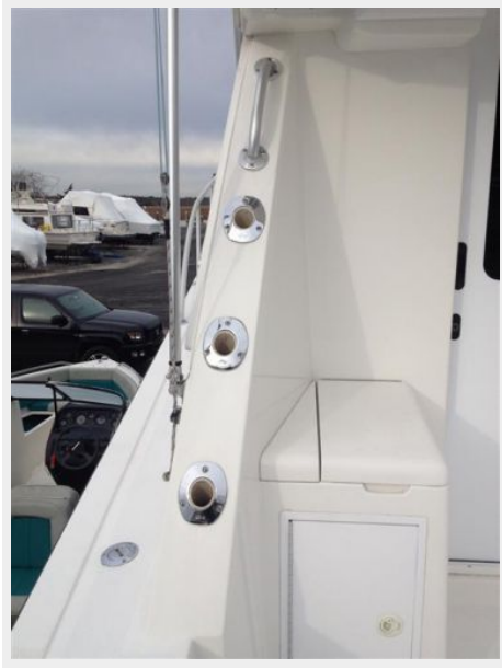
Cockpit / Fishing Equipment 3 - Rod Holders in Gunnel