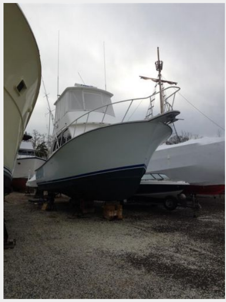
Deck 1 - Bow