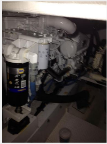
Engine & Mechanical Equipment 2