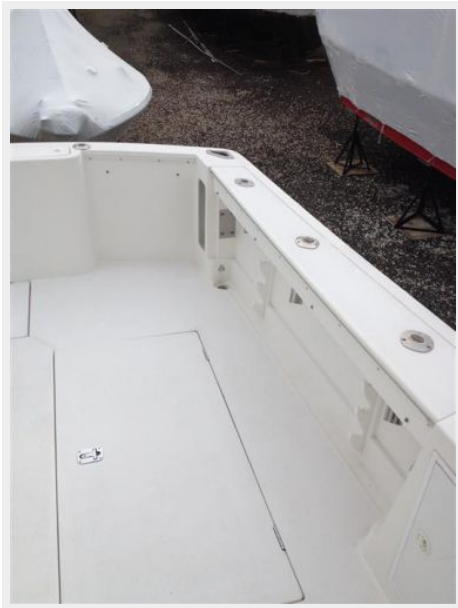
Cockpit / Fishing Equipment 5 - Rod Holders