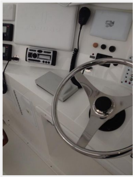
Helm / Electronics & Navigation 3