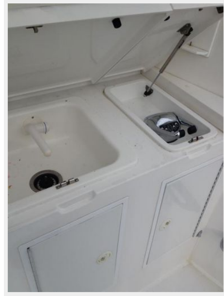
Cockpit / Fishing Equipment 4 - Cockpit Sink & Engine Controls