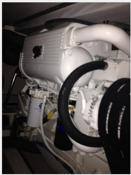
Engine & Mechanical Equipment 4