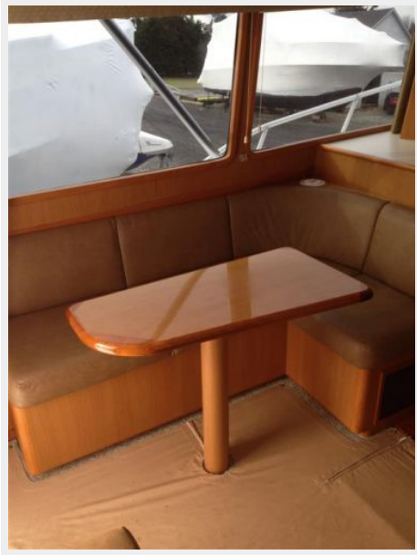
Salon 2 - Dinette