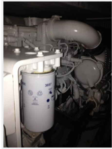
Engine & Mechanical Equipment 3