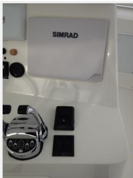
Helm / Electronics & Navigation 5 - Electronics