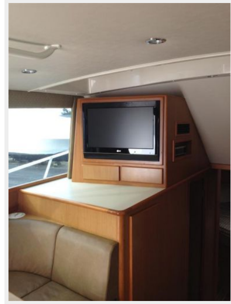
Salon 3 - Entertainment Center