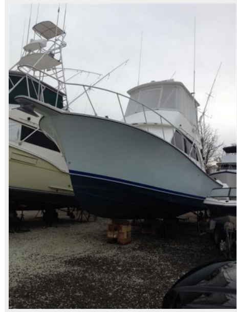
Deck 2 - Bow