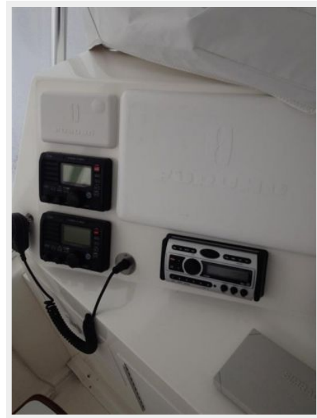
Helm / Electronics & Navigation 4 - Electronics