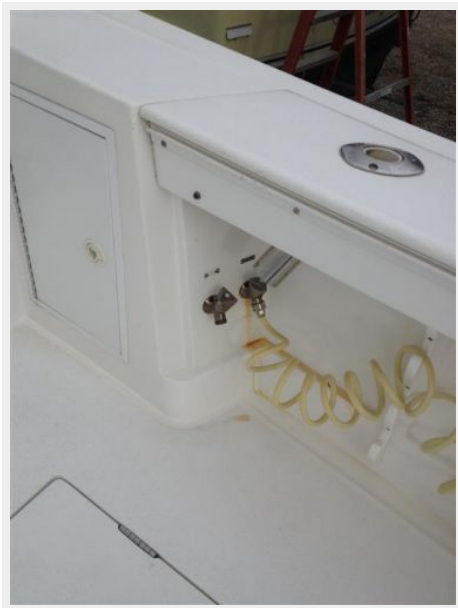
Deck 3 - Salt Water Wash Down