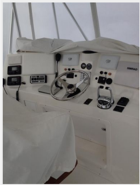
Helm / Electronics & Navigation 1