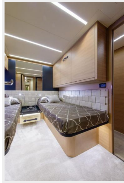
Guest cabin 2