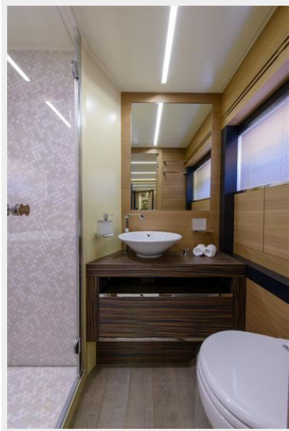
Guest cabin 2 head