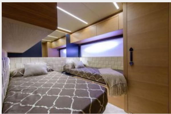
Guest cabin 1