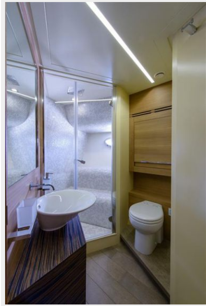
VIP cabin head