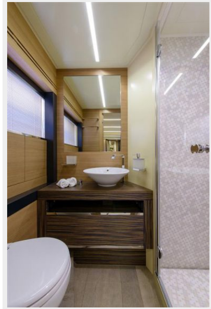
Guest cabin 1 head