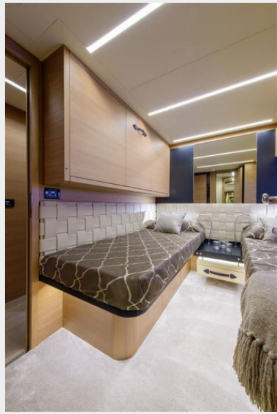
Guest cabin 1