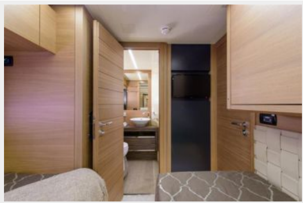
Guest cabin 3