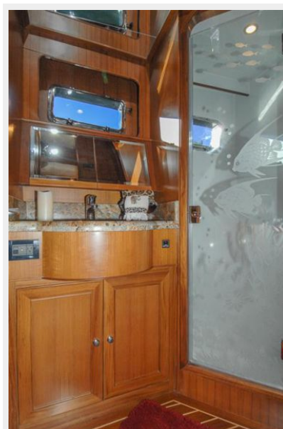
Master Stateroom Bath