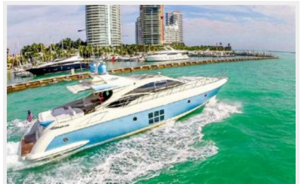
Profile Starboard II