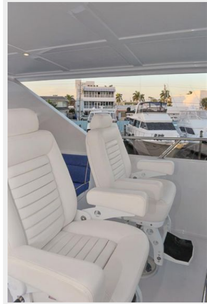
Flybridge Helm Seats