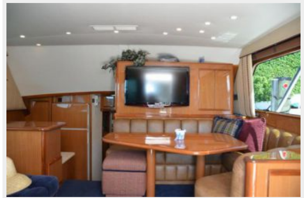
50 Post Marine Convertible Sportfish