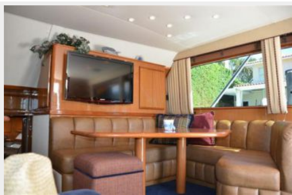
50 Post Marine Convertible Sportfish