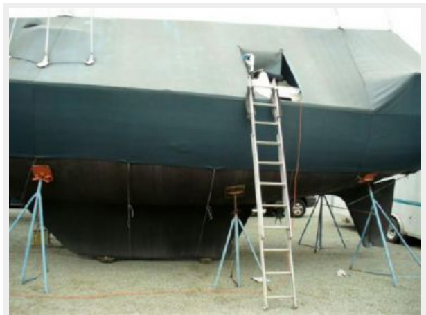
KEEL & SKEG RUDDER