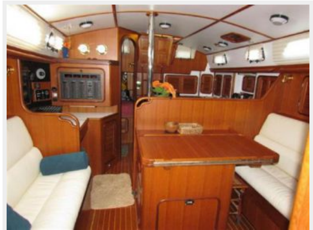
MAIN SALON LOOKING AFT