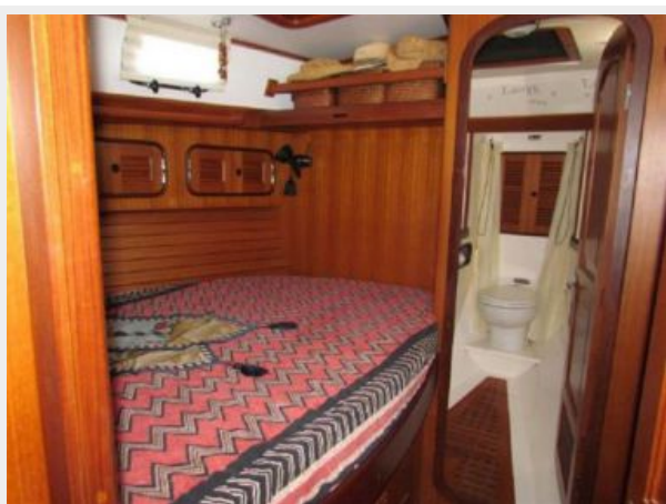
OWNER'S CABIN PORT SIDE PULLMAN BERTH