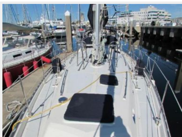
DECK LOOKING AFT