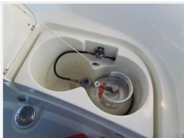
HELM SEAT PROPANE LOCKER