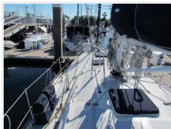
PORT SIDE DECK LOOKING FORWARD