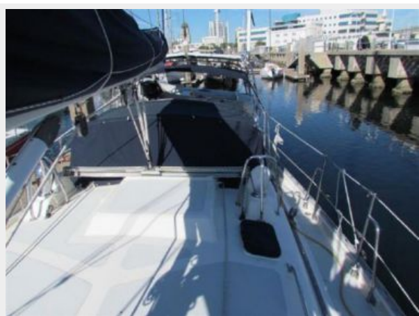
PORT SIDE DECK LOOKING AFT