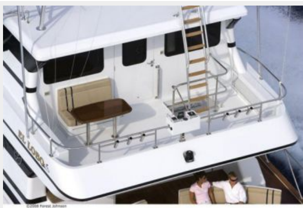
Upper Aft Deck