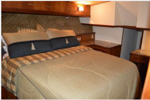
54' Egg Harbor Master Stateroom