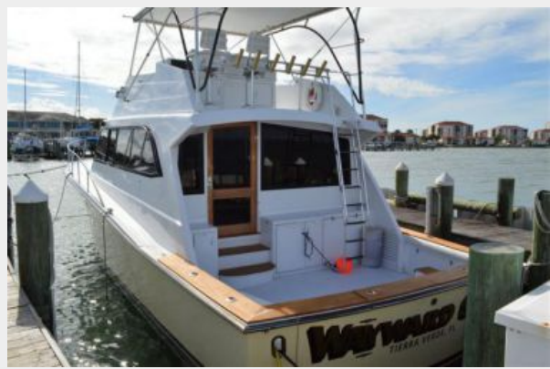
54' Egg Harbor Port Aft Profile