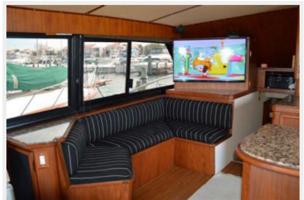
54' Egg Harbor Salon Forward