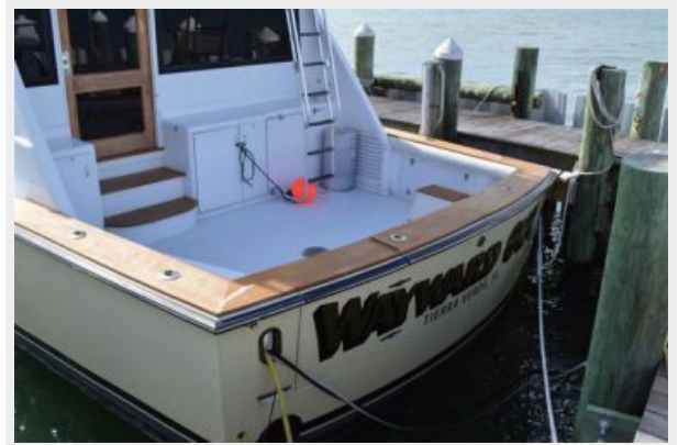
54' Egg Harbor Cockpit