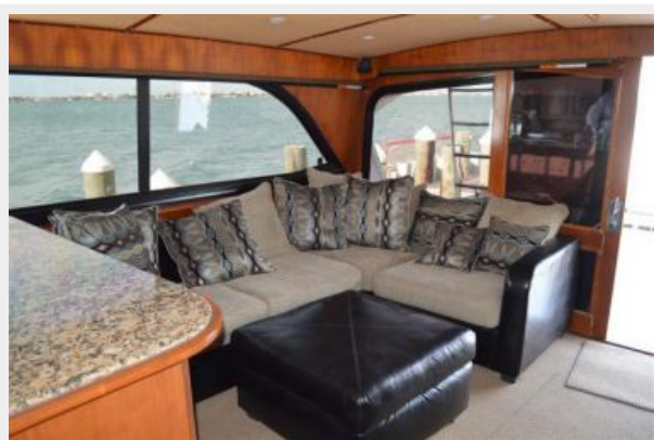
54' Egg Harbor Salon Aft