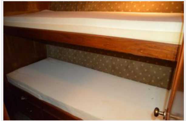
54' Egg Harbor Guest Stateroom