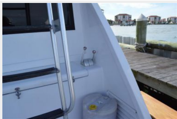
54' Egg Harbor Cockpit Controls