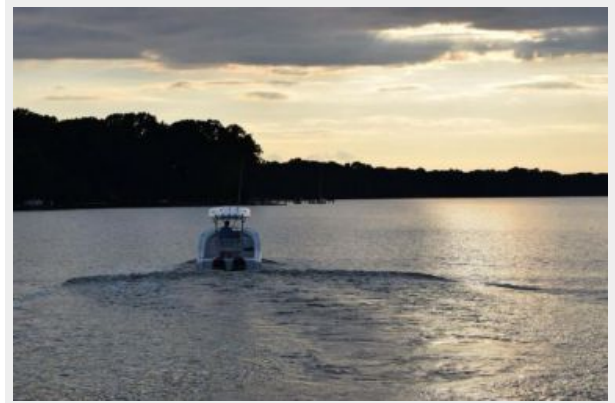
Into The Sunset