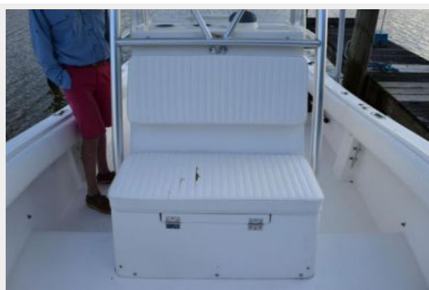
Cushions and Pads