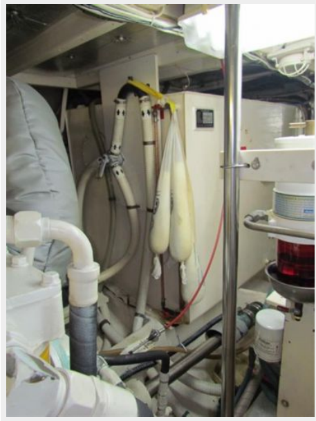
Engine Room Port Tank