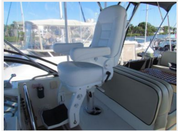
LleBroc Helm Seat New