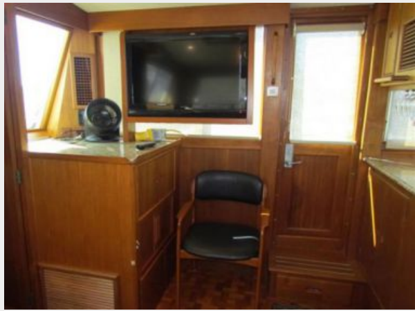
Port Saloon Aft