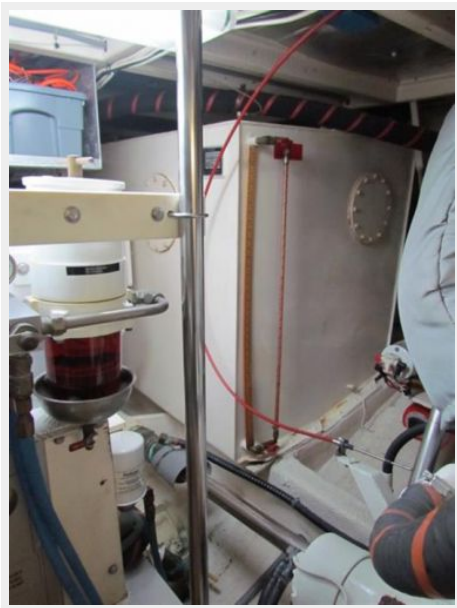
Engine Room Starboard Fuel