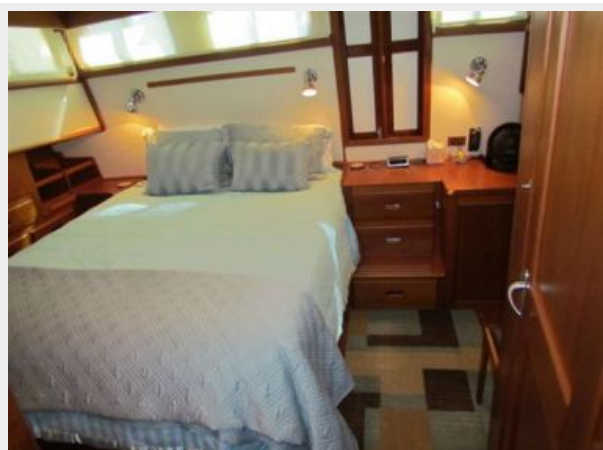
Master Stateroom Queen