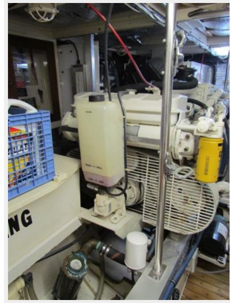
Engine Room Port