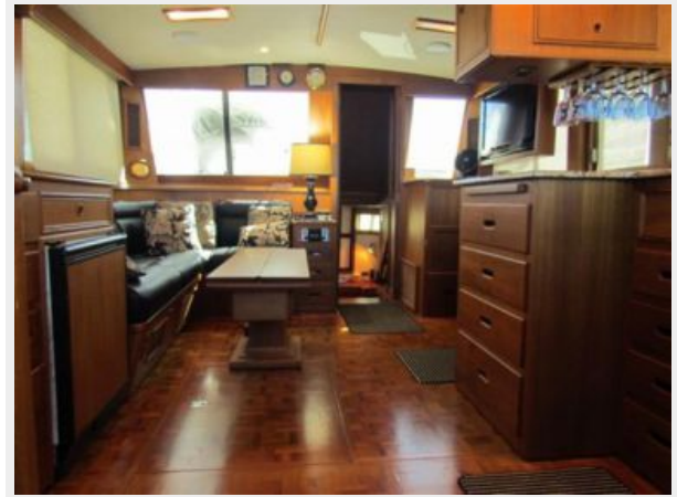
Saloon Looking Aft