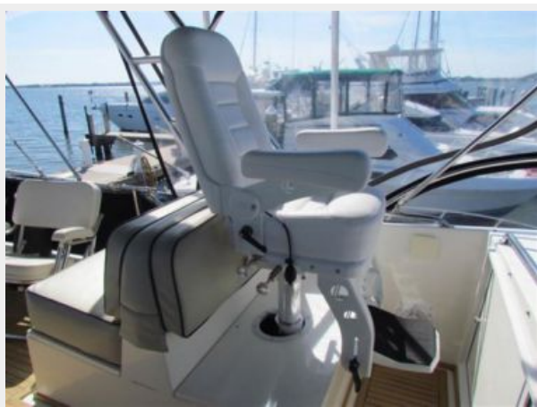
LleBroc Port Helm Seat New