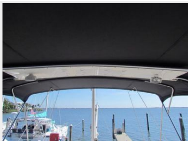
Flybridge Overhead Lighting