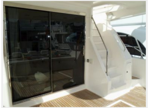
Aft Deck Salon Entry Door