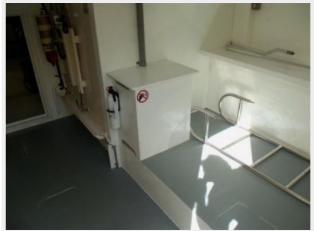
Lazarette to Starboard