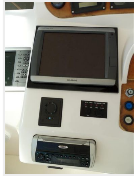
Helm Detail Port