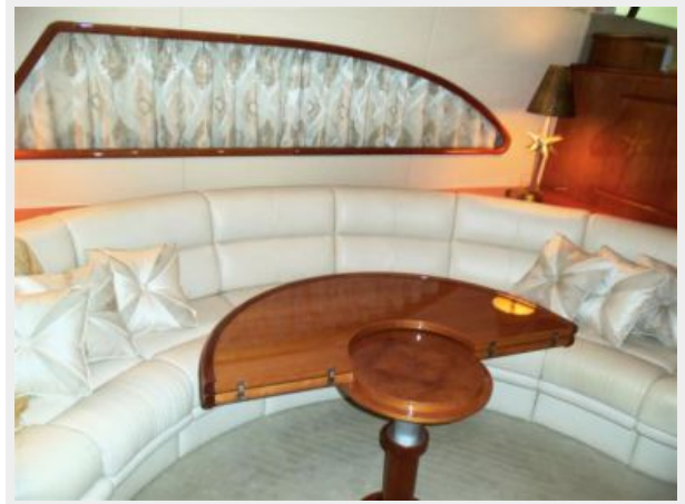
Salon to Port