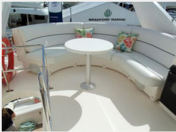
Flybridge Aft Seating