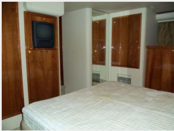
Master Looking Forward