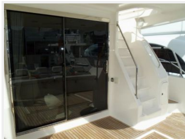
Aft Deck Salon Entry Door