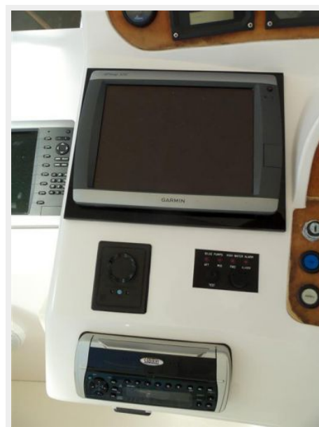
Helm Detail Port