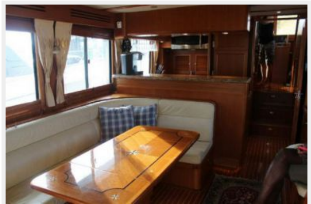
Salon looking forward to port