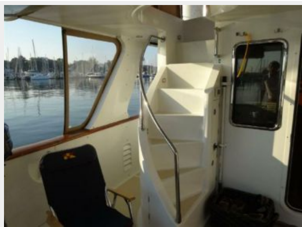
Stairs to flybridge