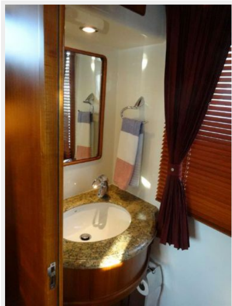
Day Head Basin