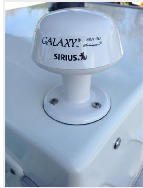
Head under console