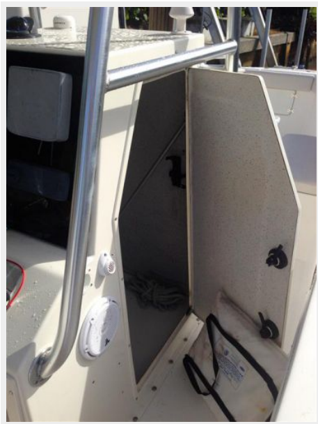
Head under console