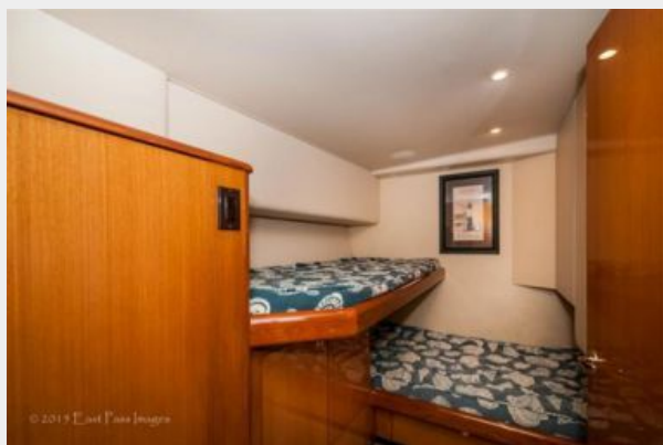
Starboard Bunk Room