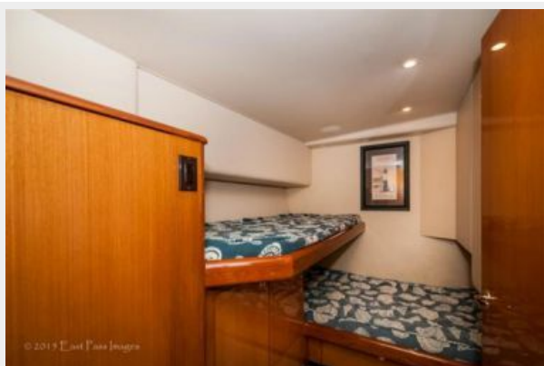
Starboard Bunk Room