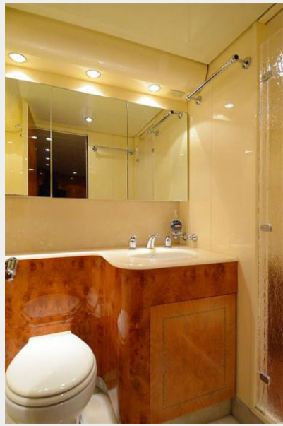
Master Bath Hers