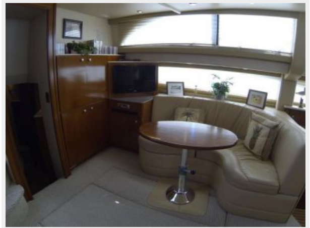
Dinette & TV