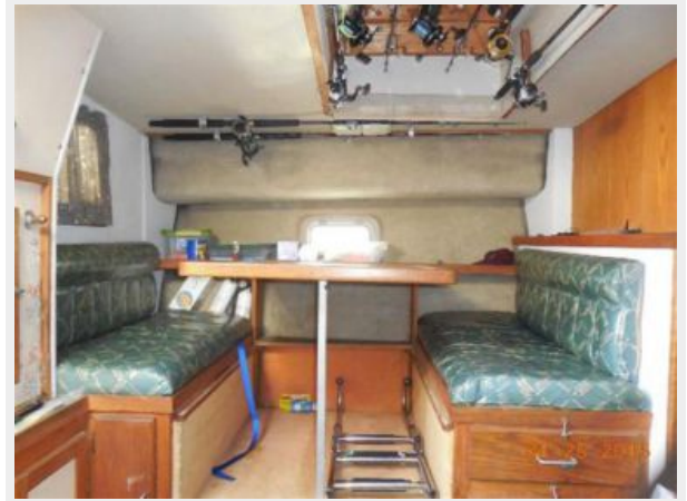
34' Luhrs Open, dinette converts to sleeper