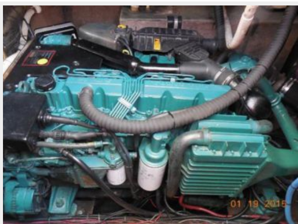
34' Luhrs Open, port side engine