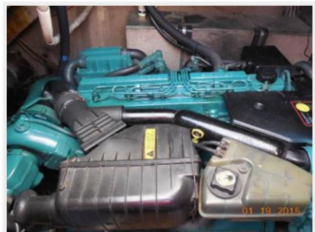
34' Luhrs Open, stbd side engine