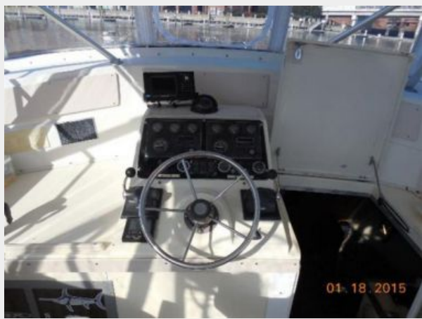
34' Luhrs Open, main helm station