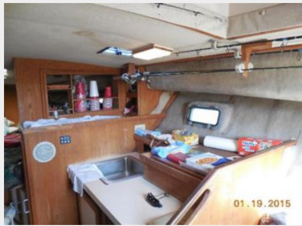
34' Luhrs Open, galley and storage