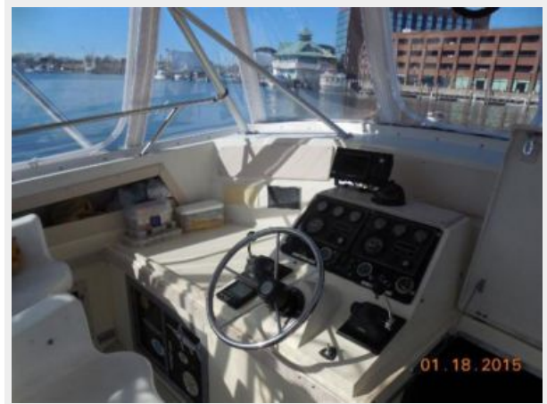
34' Luhrs Open, port side of helm