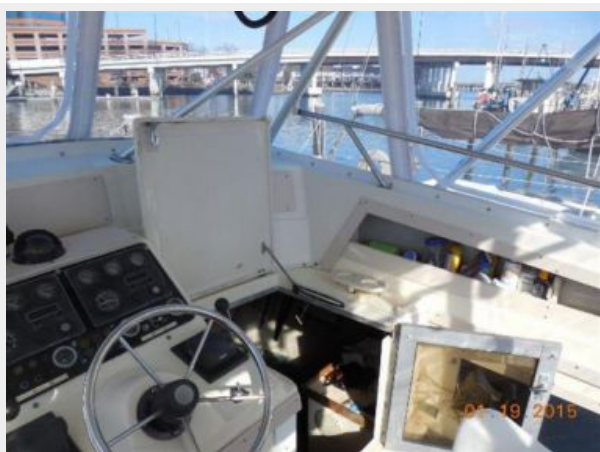
34' Luhrs Open, stbd side of Helm