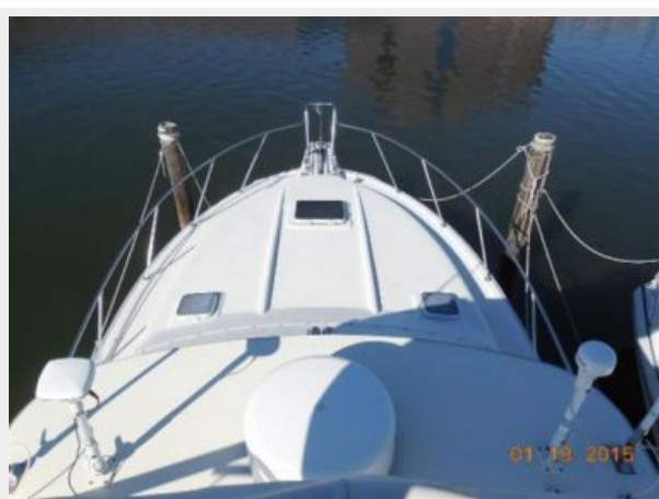
34' Luhrs Open, foredeck view from the tower