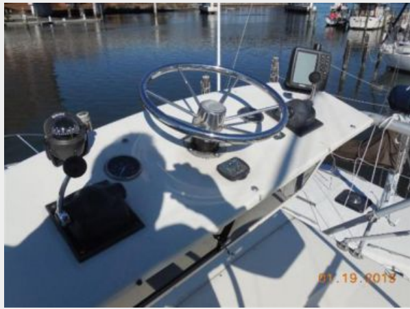
34' Luhrs Open, tower control station