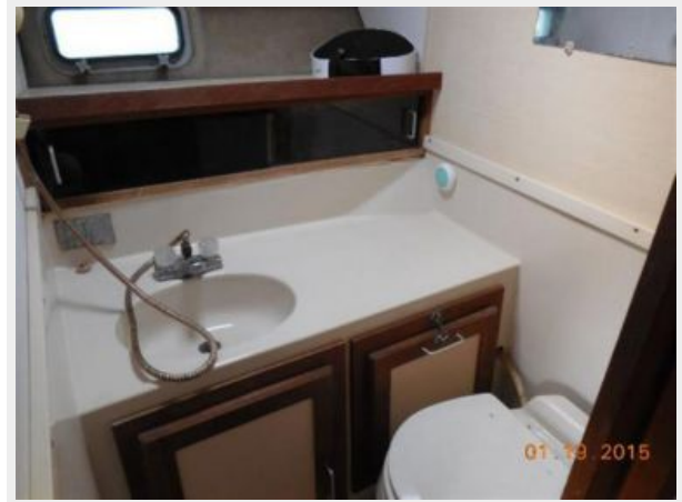
34' Luhrs Open, enclosed head/shower