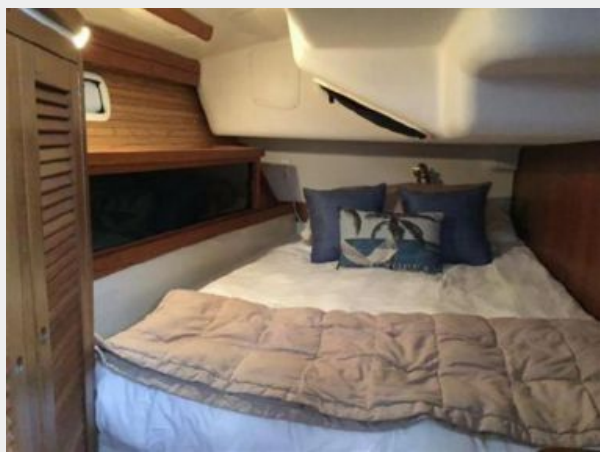
Aft Berth - Starboard