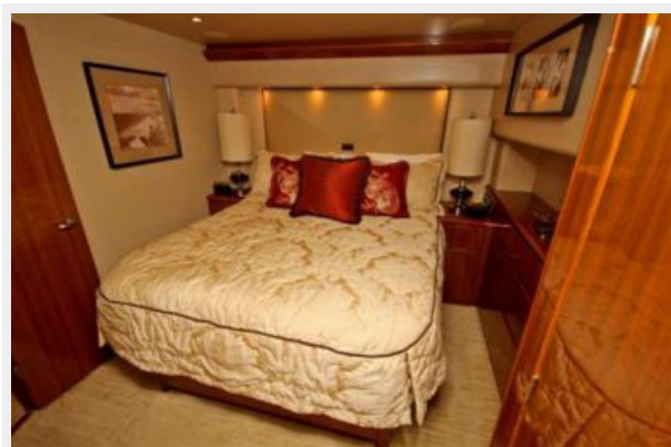
60' Viking Convertible 'At Ease' Master Stateroom