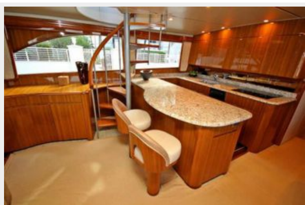
60' Viking Convertible 'At Ease' Salon/Galley