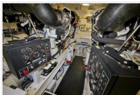
60' Viking Convertible 'At Ease' Engine Room