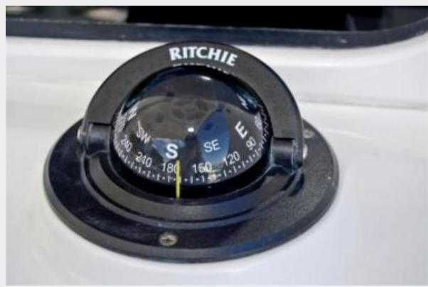
60' Viking Convertible 'At Ease' Ritchie Compass