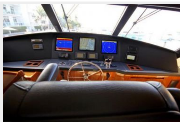
60' Viking Convertible 'At Ease' Enclosed Bridge Dash