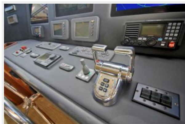
60' Viking Convertible 'At Ease' Helm