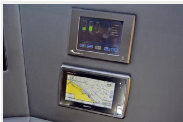
60' Viking Convertible 'At Ease' Octoplex and Garmin Backup GPS