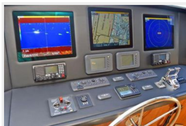
60' Viking Convertible 'At Ease' Flybridge Electronics