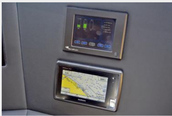
60' Viking Convertible 'At Ease' Octoplex and Garmin Backup GPS