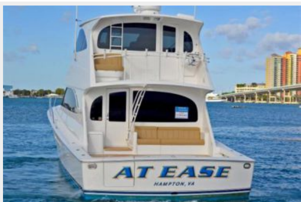
60' Viking Convertible 'At Ease'