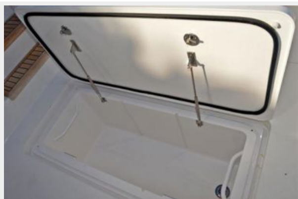
60' Viking Convertible 'At Ease' Fishbox