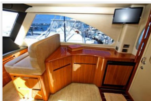
60' Viking Convertible 'At Ease' FLYbridge Bar