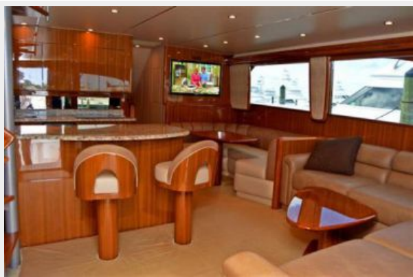
60' Viking Convertible 'At Ease' Salon