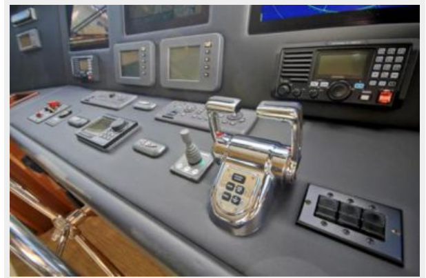
60' Viking Convertible 'At Ease' Helm