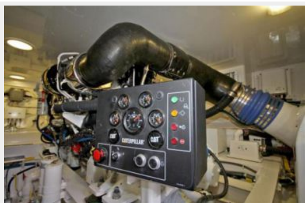
60' Viking Convertible 'At Ease' Stbd Engine