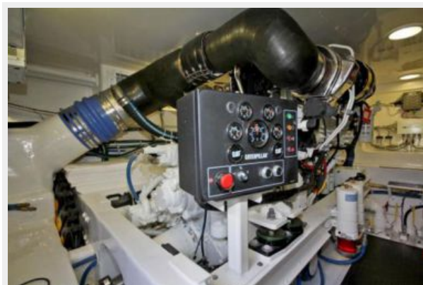
60' Viking Convertible 'At Ease' Port Engine