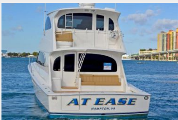
60' Viking Convertible 'At Ease'