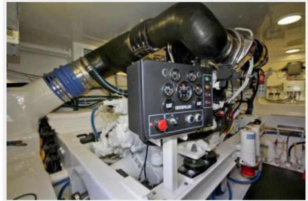
60' Viking Convertible 'At Ease' Port Engine