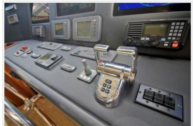
60' Viking Convertible 'At Ease' Helm