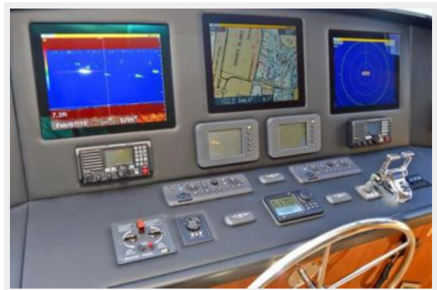
60' Viking Convertible 'At Ease' Flybridge Electronics