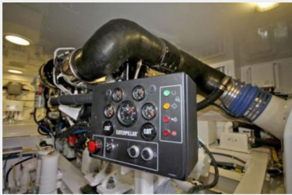
60' Viking Convertible 'At Ease' Stbd Engine