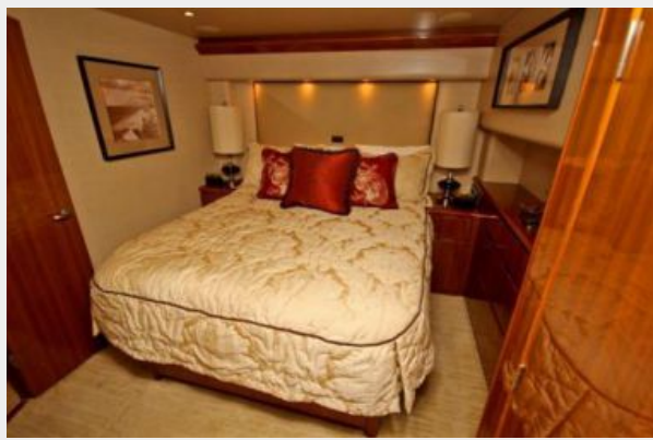
60' Viking Convertible 'At Ease' Master Stateroom