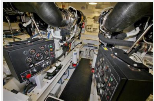
60' Viking Convertible 'At Ease' Engine Room