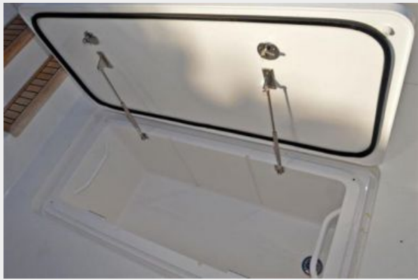
60' Viking Convertible 'At Ease' Fishbox